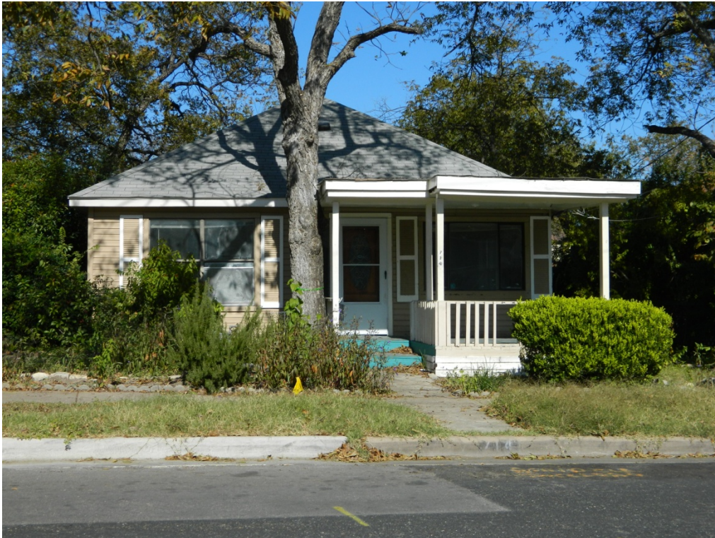
714 West Johanna Street ca. 1939