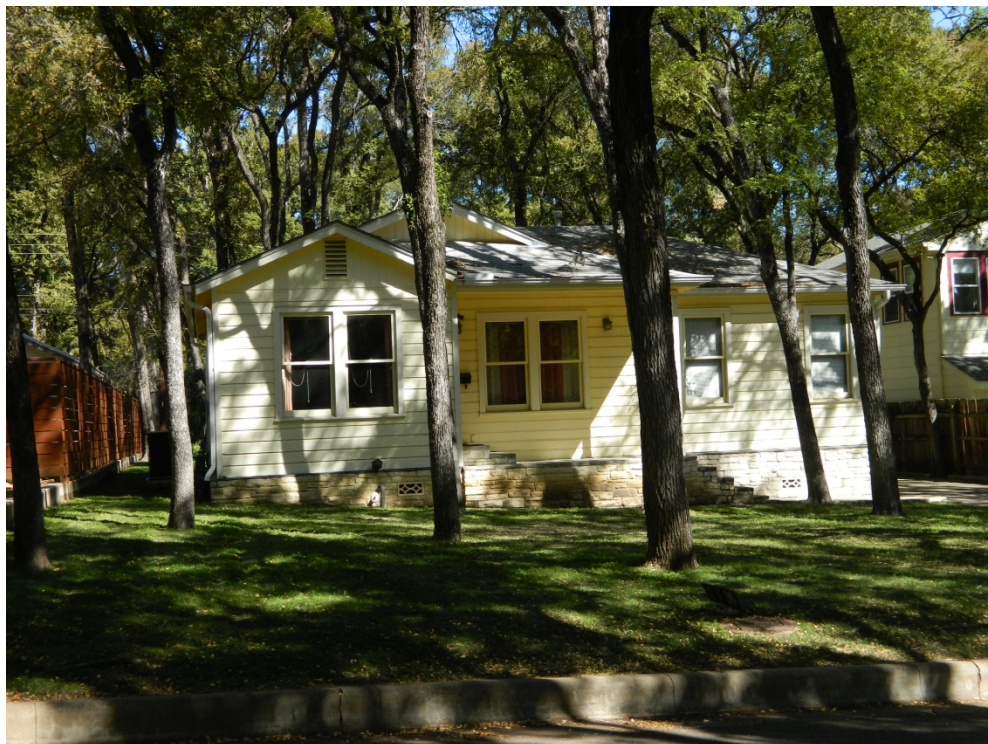
2906 Cherry Lane ca. 1948