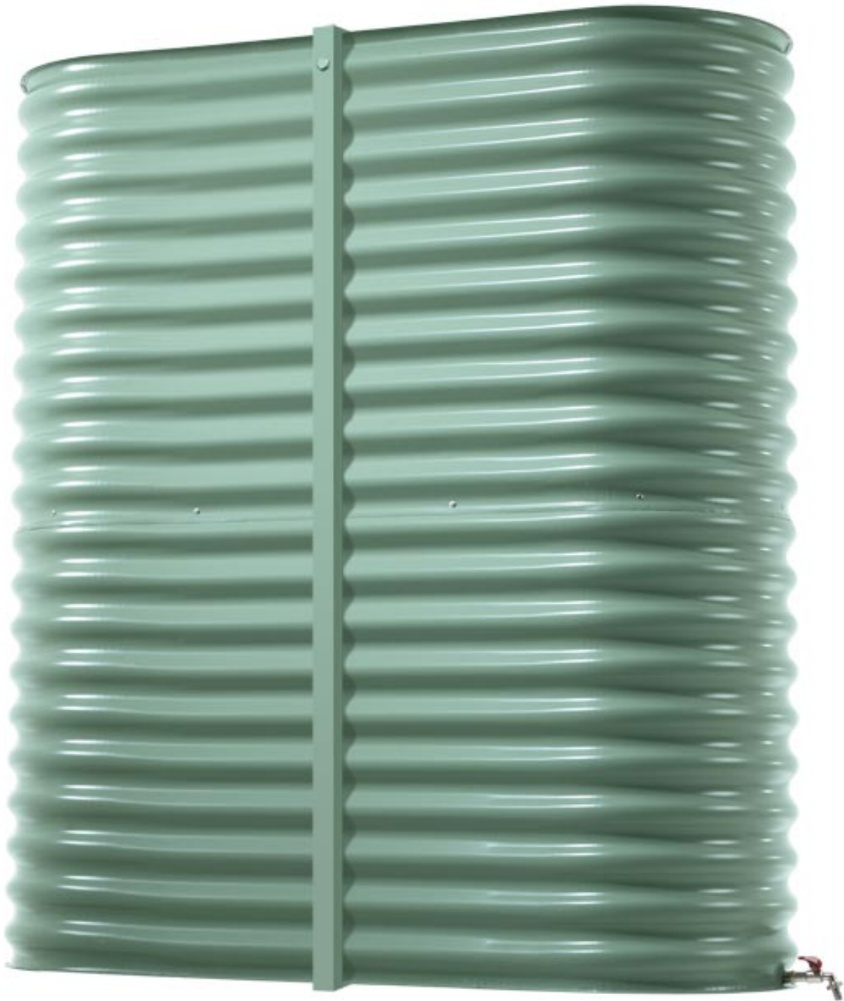
Rain Catchment Tank: Front & Rear Elevation (East & West)