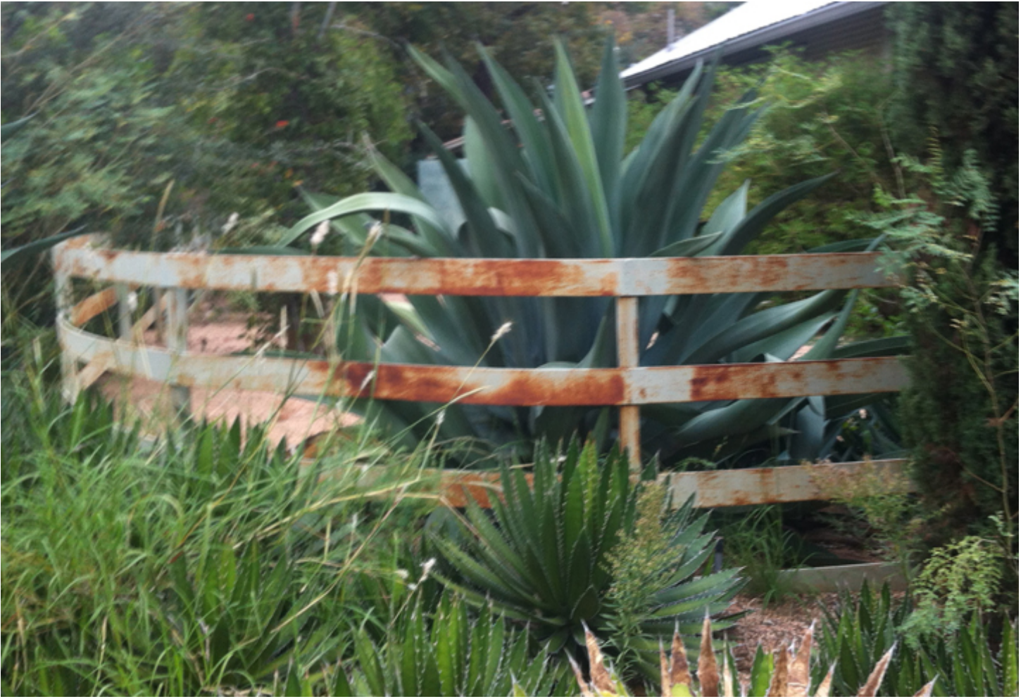
Steel Flat-bar Driveway Fence: Front Elevation (East)