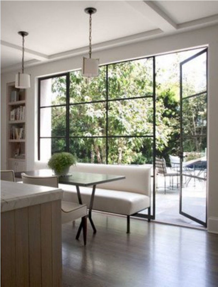
Steel Windows & Doors: Rear Elevation (West)