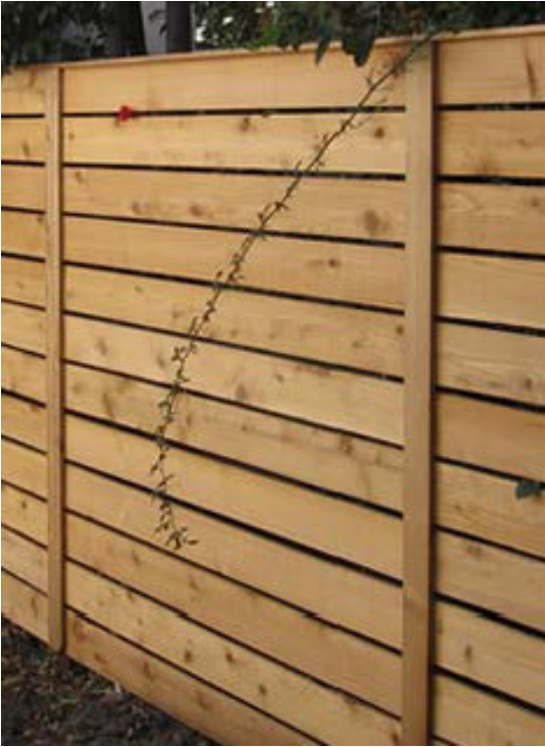
Outdoor Shower Fence: Rear Elevation (West)