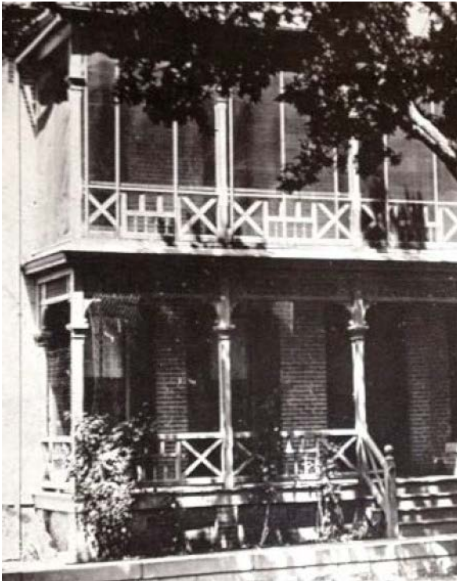
Historic photograph, detail of the front porch