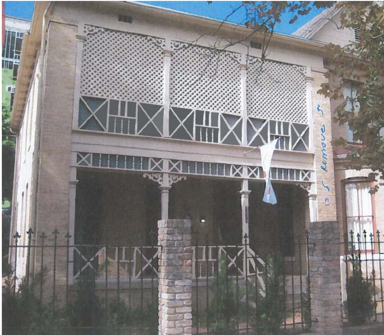
Current photograph of the front porch showing the brick posts to be removed.