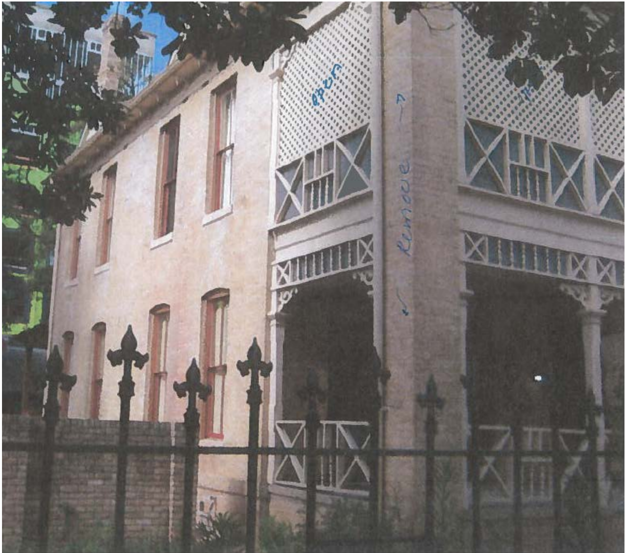
Current photo of the south side of the front porch showing the brick column to be removed and the non-historic latticework to be removed to restore the open front porches shown in historic photographs.