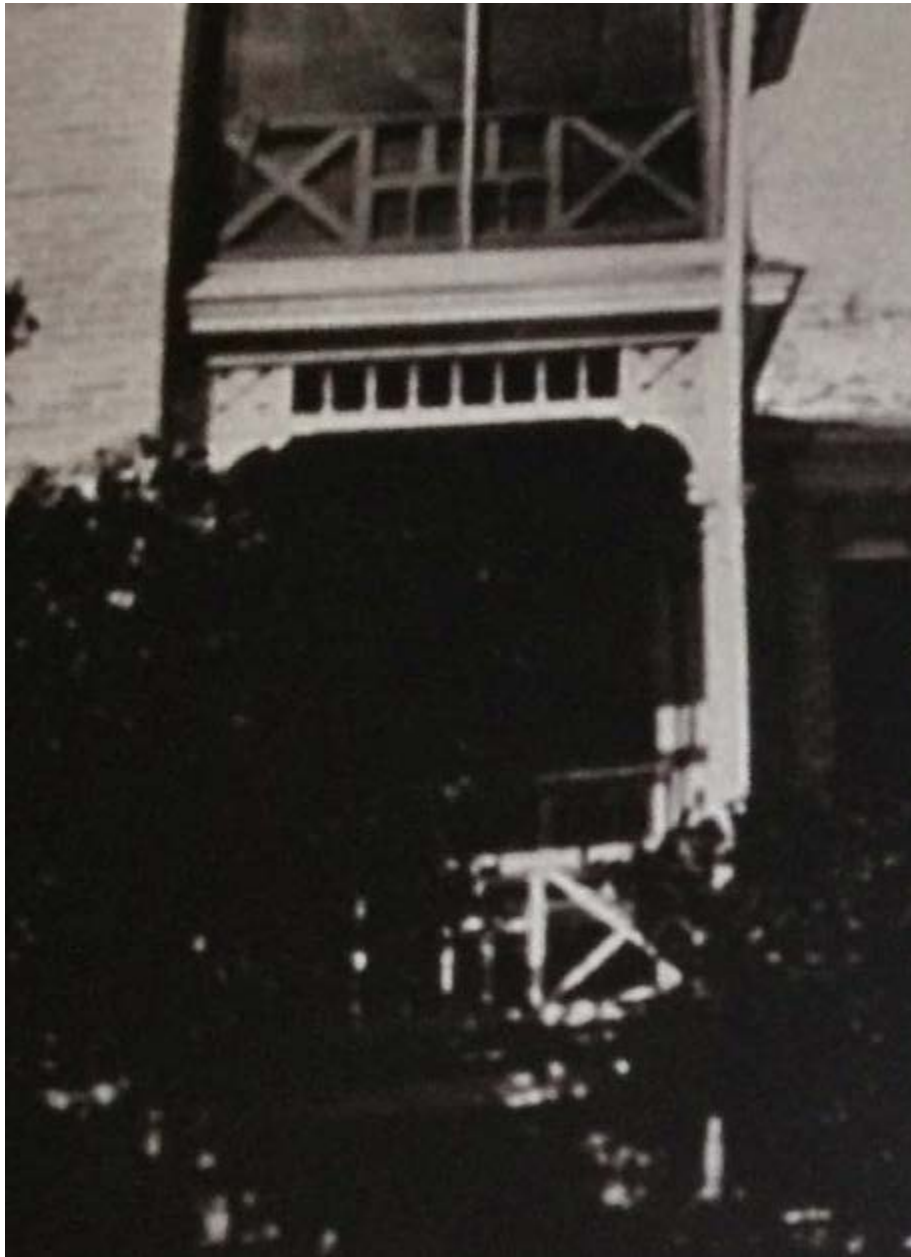
Historic photograph – detail of the south side of the front porch