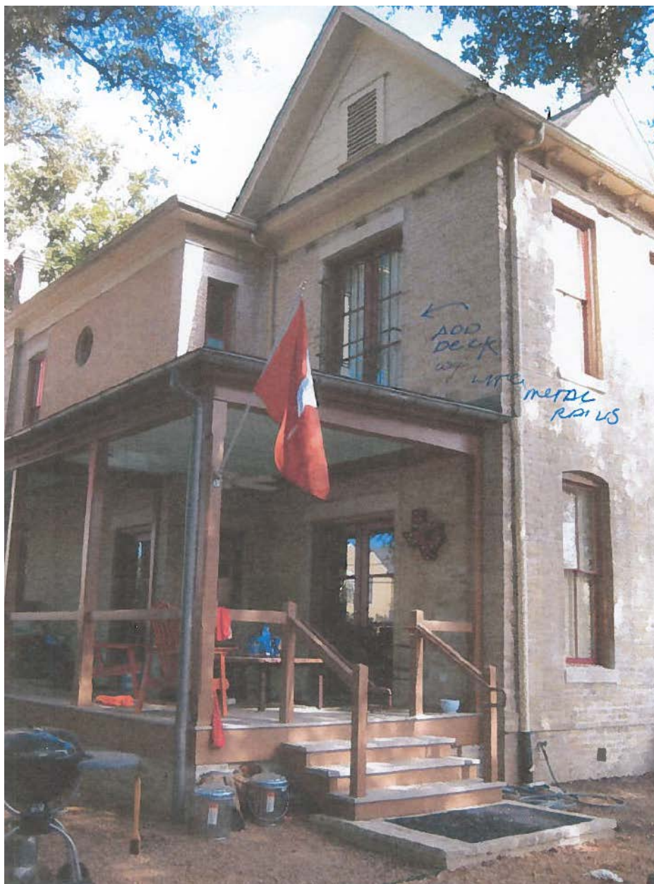
Current photograph of the back of the house showing the location of the proposed roof deck.