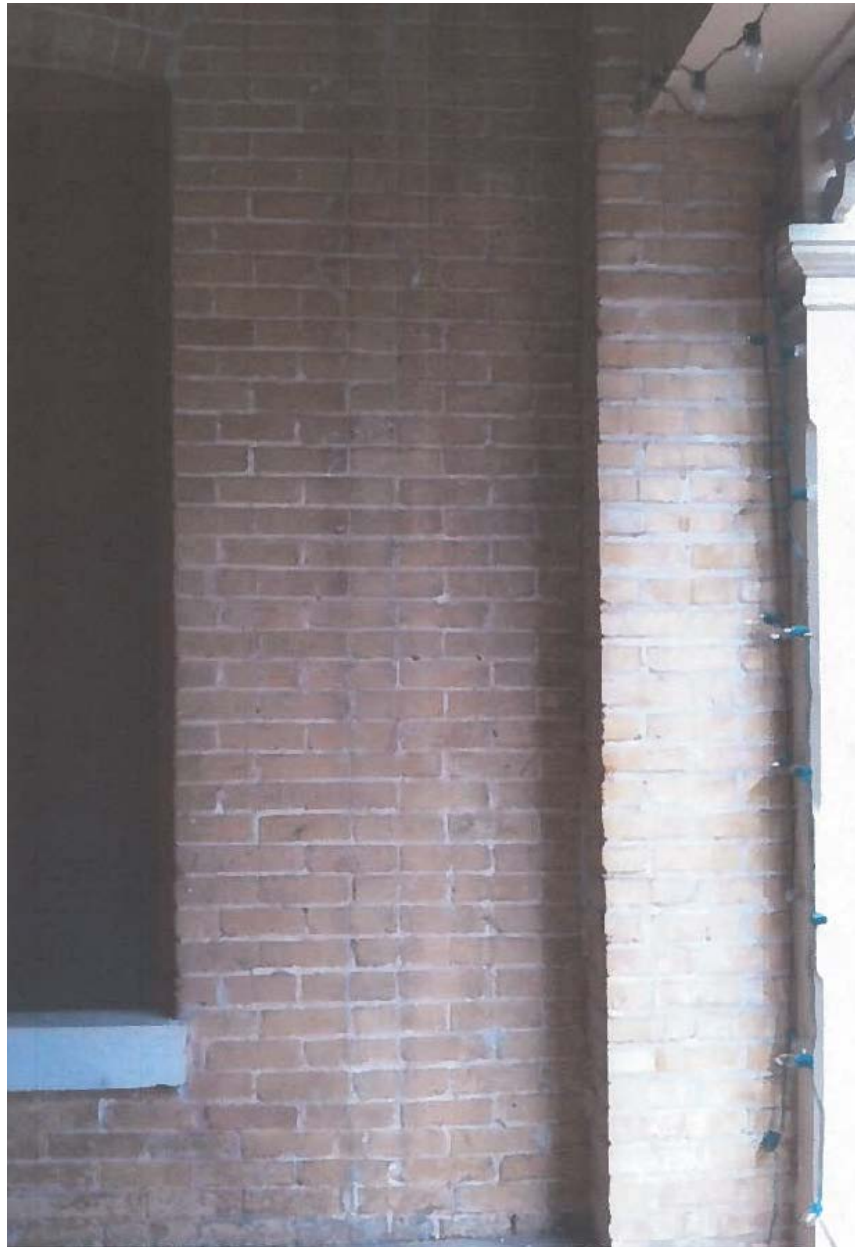
Detail showing the difference in the brickwork from the main house to the porch posts proposed for removal.