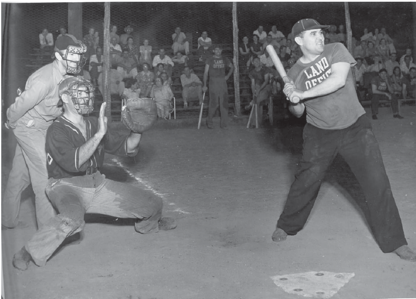
Major City League Softball, 1942