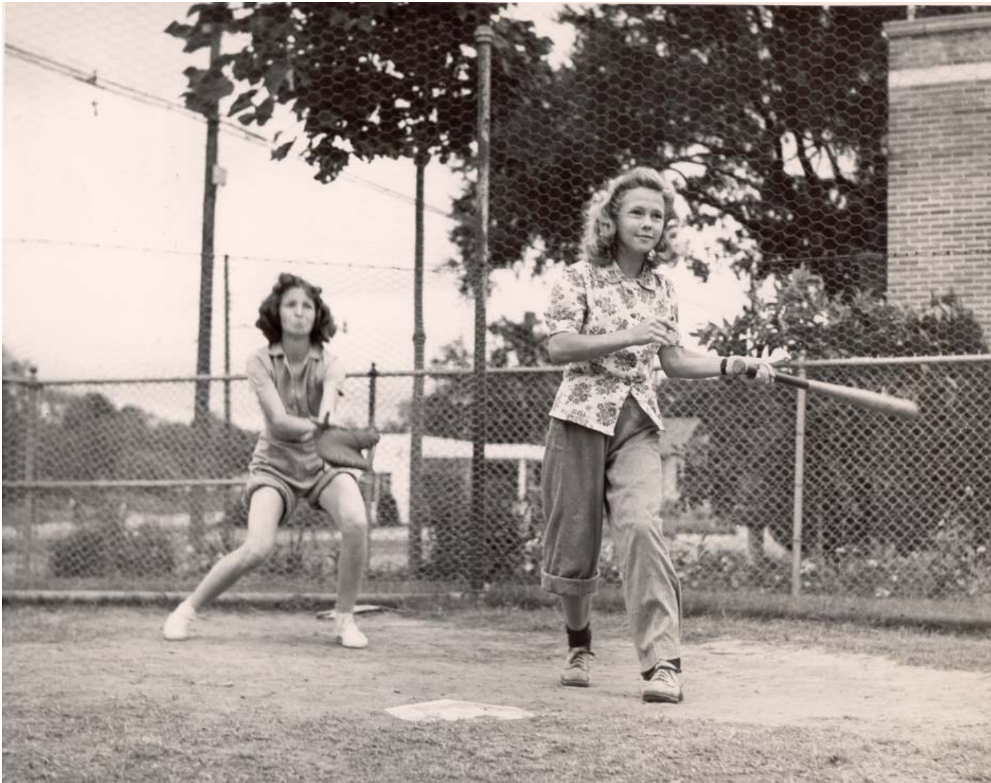
Baseball, c. 1940s