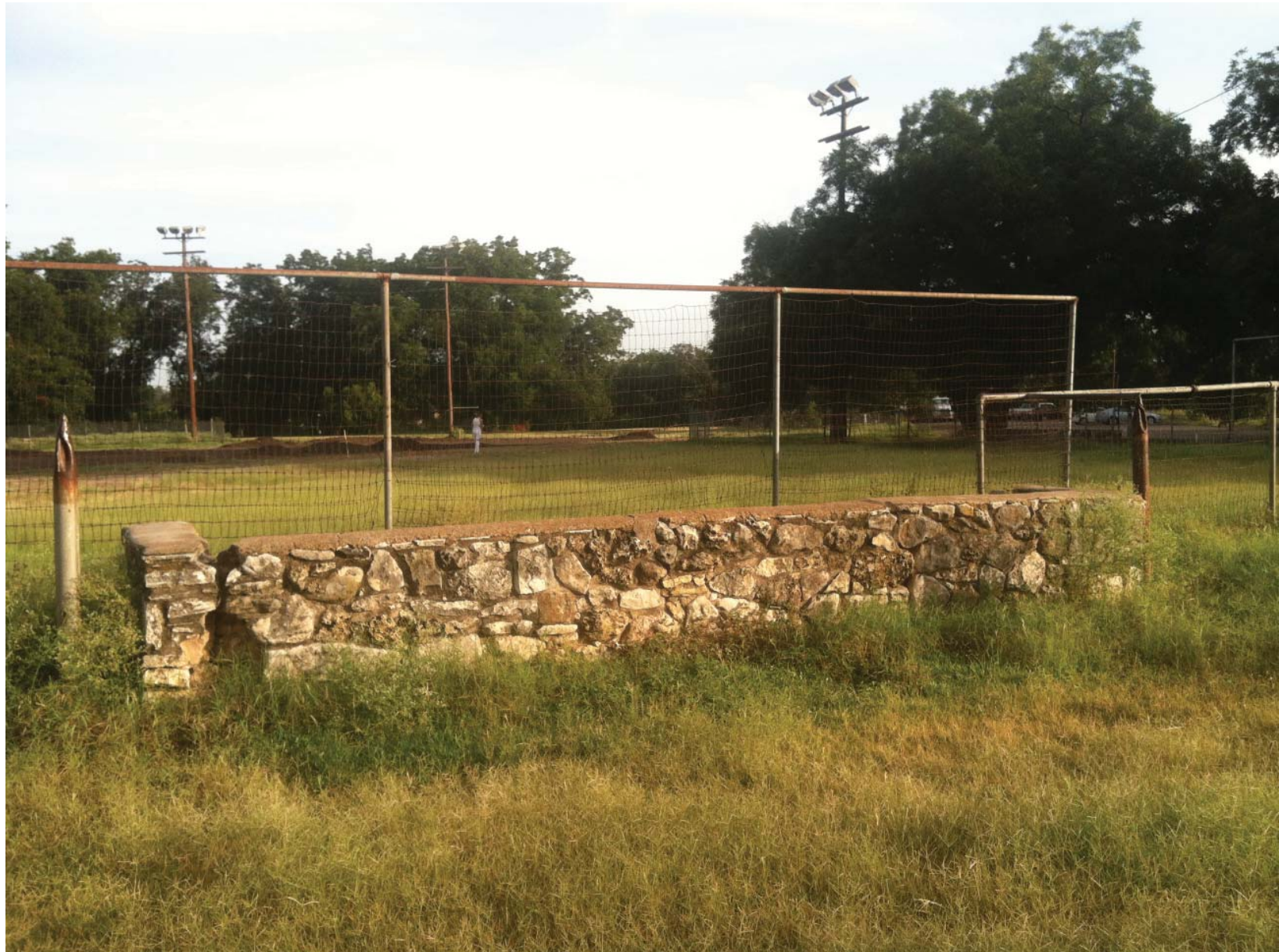
Robert E. Lee Ballfields