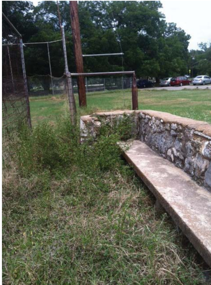
Robert E. Lee Ballfields