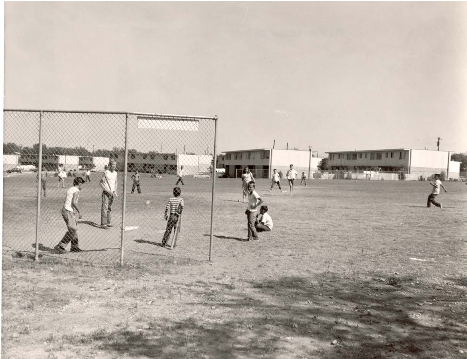
1956 ball game at Meadowbrook Housing