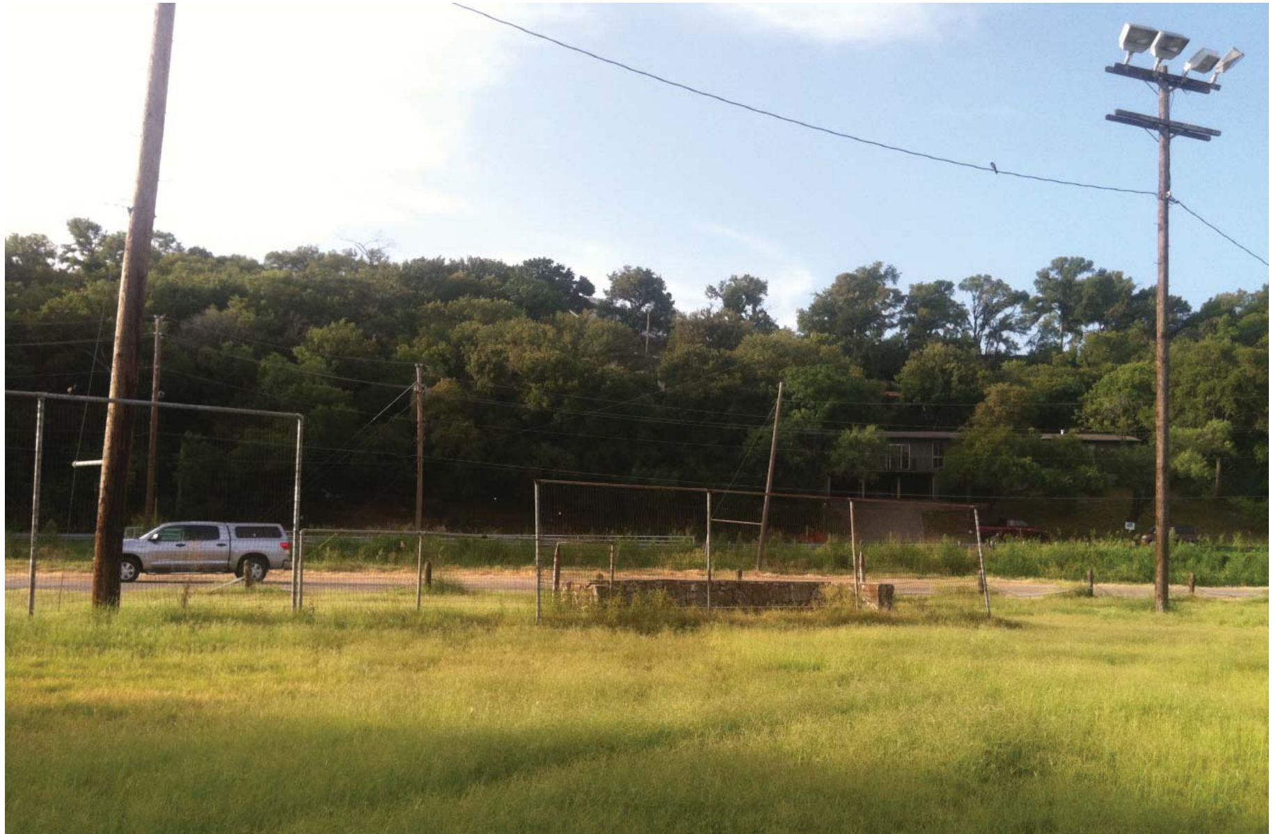
Robert E. Lee Ballfields