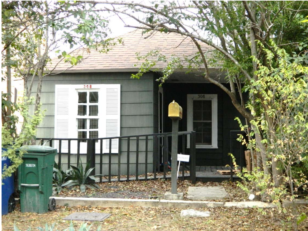
308 West Milton Street ca. 1930