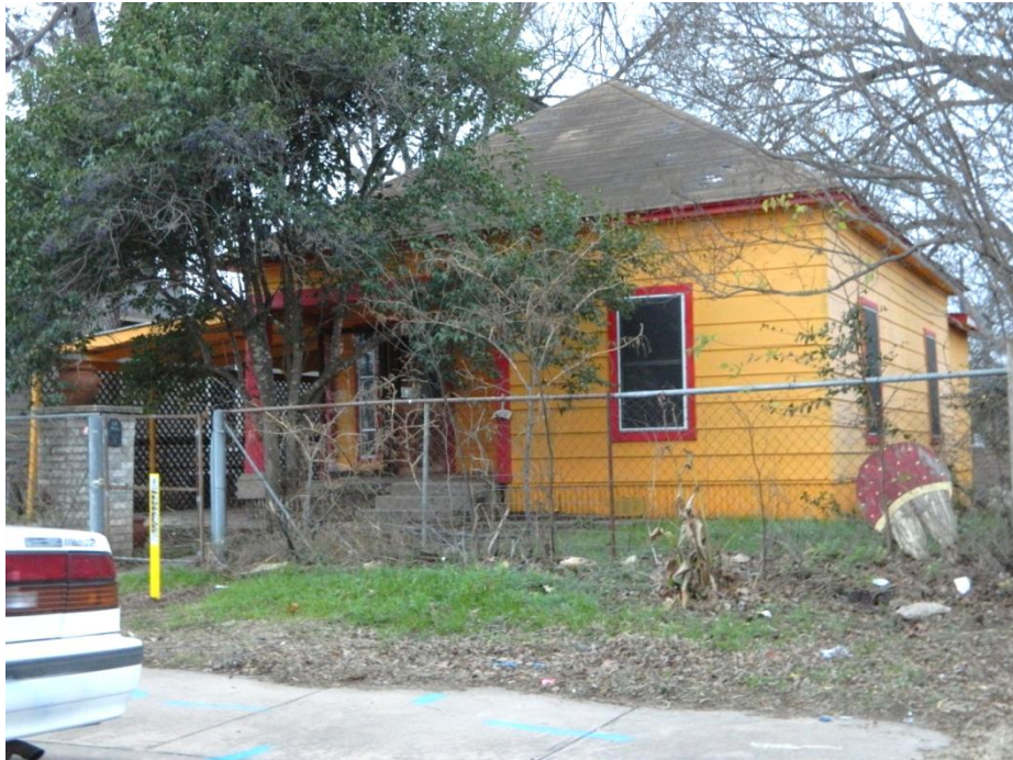
1905 Garden Street ca. 1911