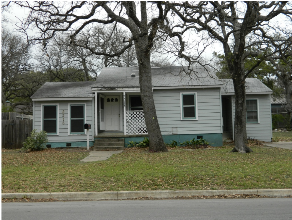
2318 W. 7 th Street ca. 1948