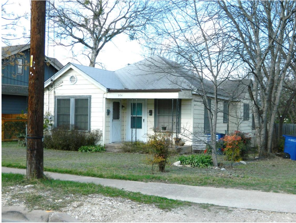
904 West Johanna Street Unknown date of construction – moved onto the lot in 1970