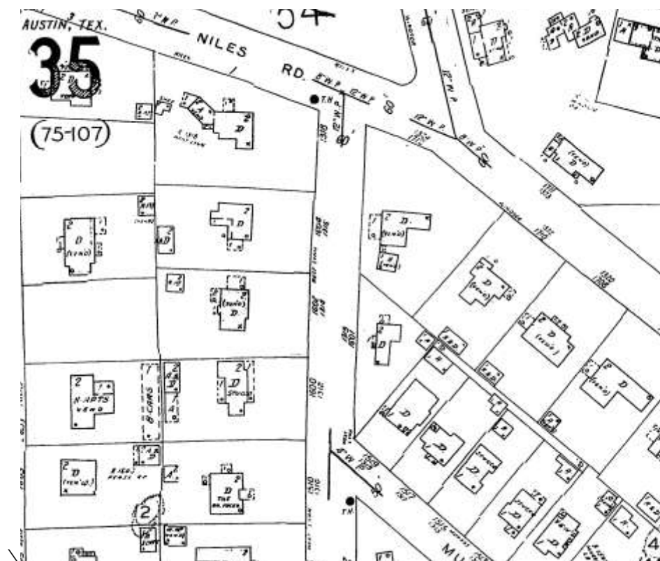
1935 Sanborn Map (indicates property previously 1315 West Lynn).