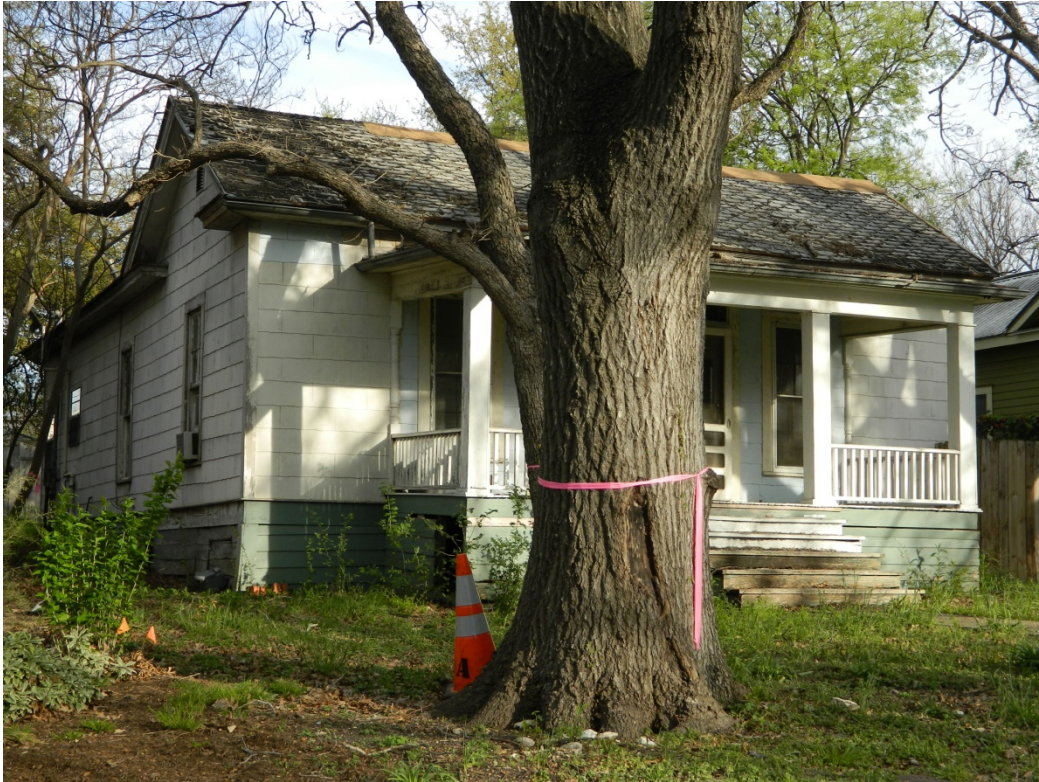
1907 Eva Street ca. 1913