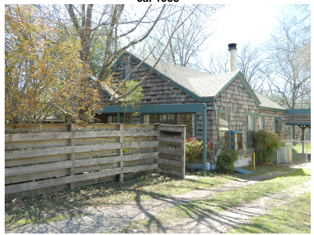
5512 Montview Street ca. 1938