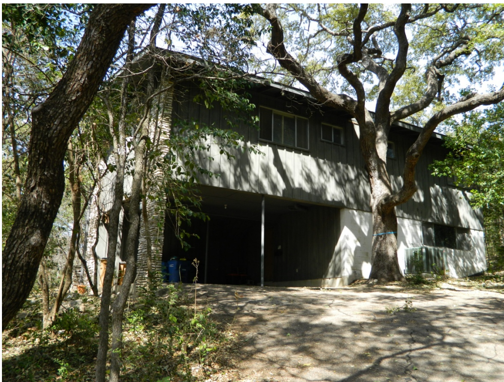
2615 Pecos Street ca. 1960