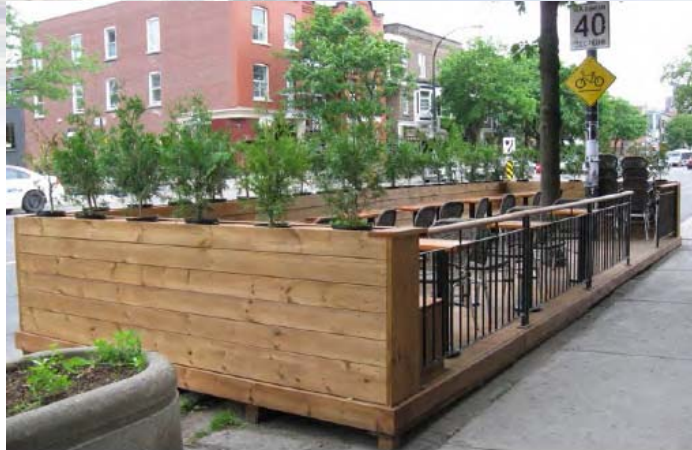
Figure 37. Terrasse, Montréal, Quebec.