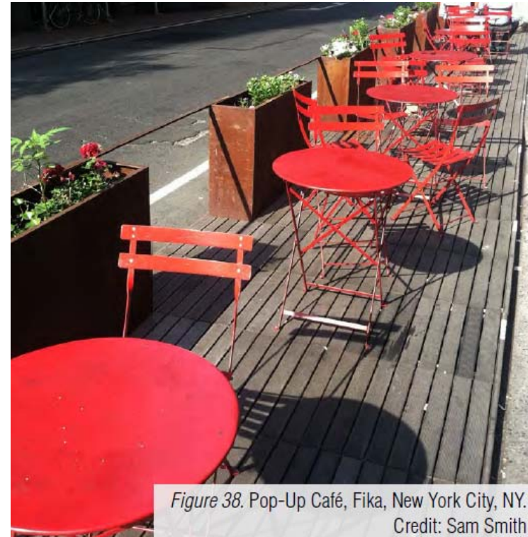
Figure 38. Pop-Up Café, Fika, New York City, NY. Credit: Sam Smith