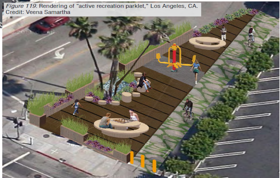
Figure 119. Rendering of "active recreation parklet," Los Angeles, CA. Credit: Veena Samartha