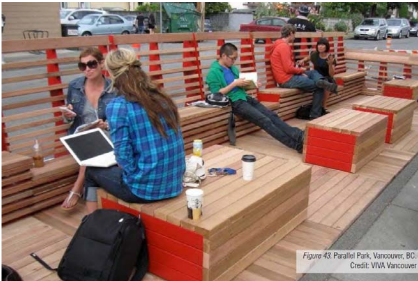
Figure 43. Parallel Park, Vancouver, BC.