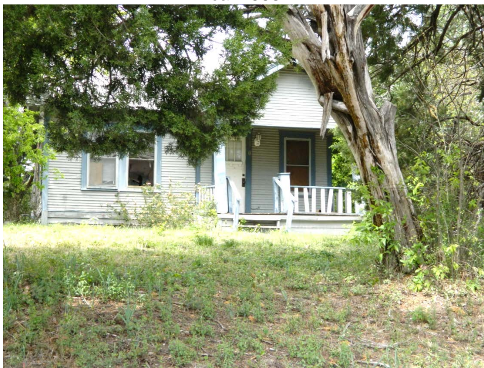
1520 Parker Lane ca. 1938