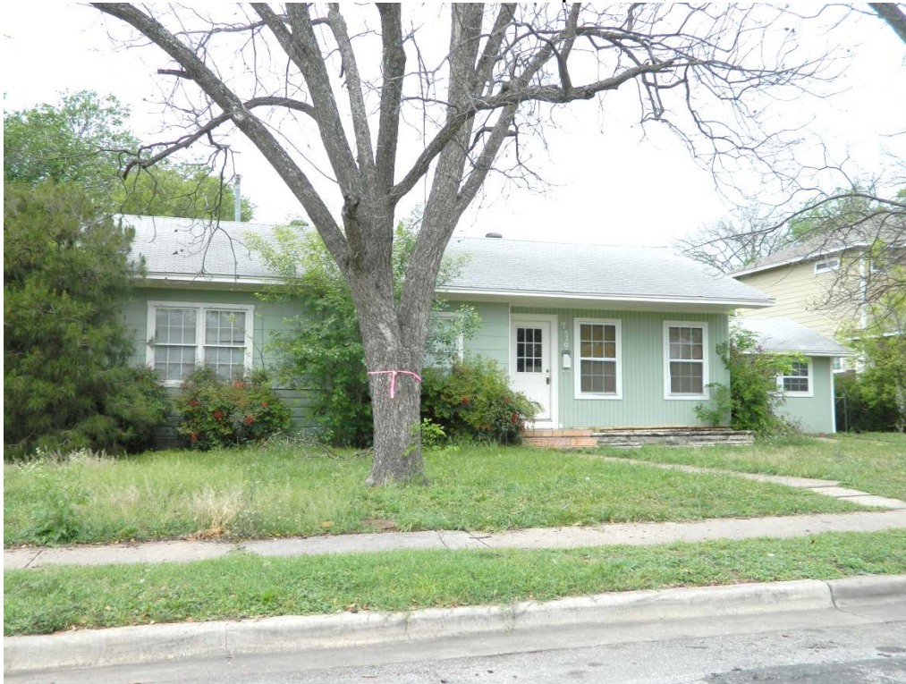
5106 Caswell Avenue Moved onto this site from Camp Swift, ca. 1950