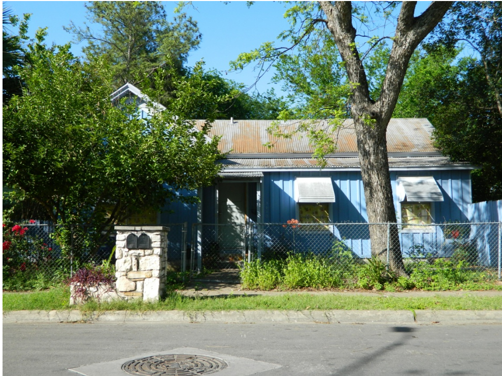
1410 Willow Street ca. 1908