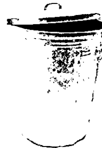
Bin 2 - Board