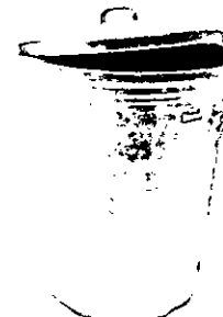
Bin 2 - Board