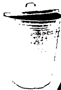
Bin 1 - Council