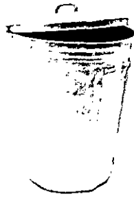
Bin 1 - Council