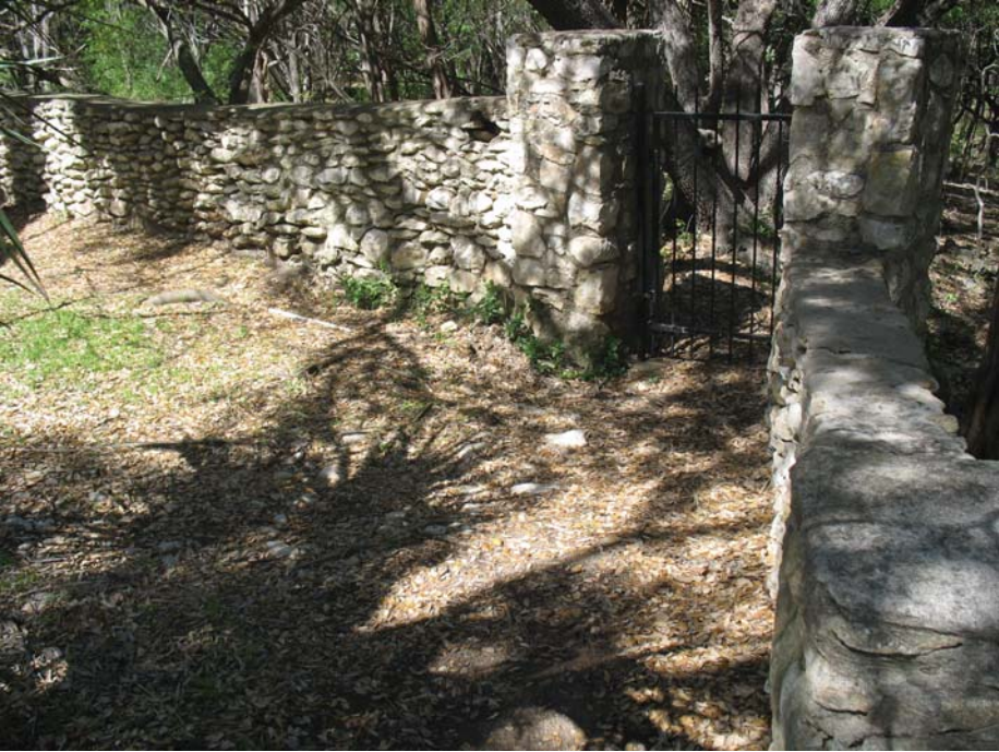
View facing North toward NE Gate -- erosion exposing irrigation pipes, roots, and depositing soil beyond gate