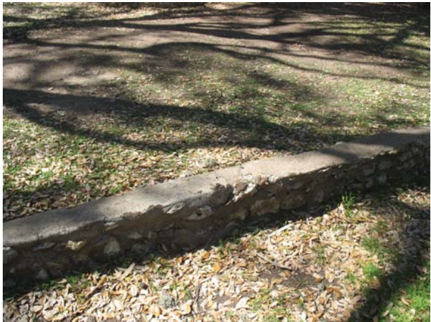
Close-up of existing wall in historic condition. Wall reconstruction to match