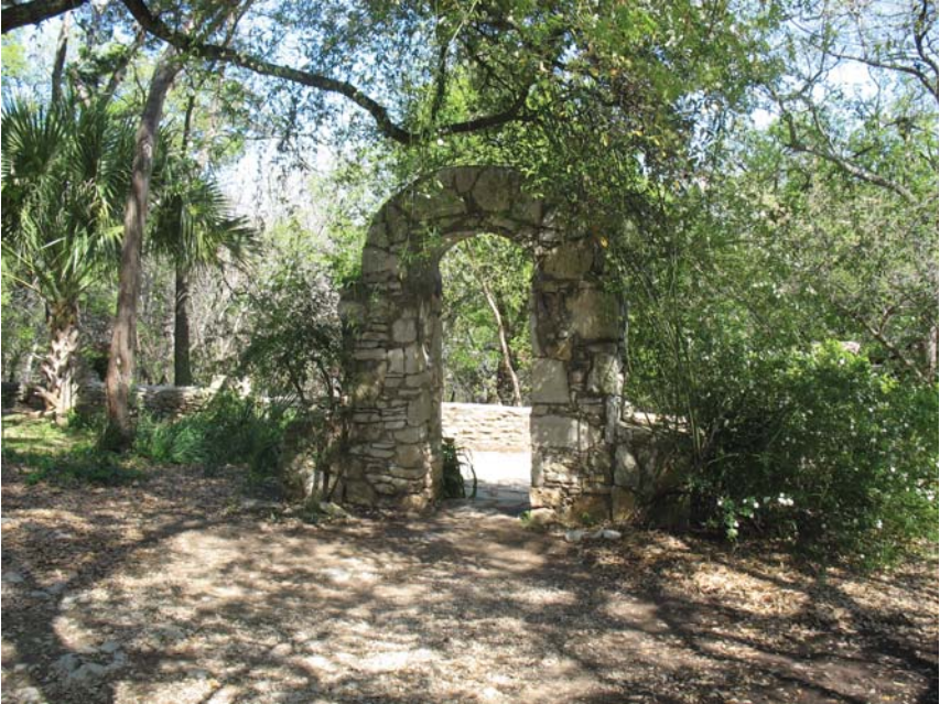
View facing East toward Arch-- erosion exposing stones and depositing soil into archway/overlook area