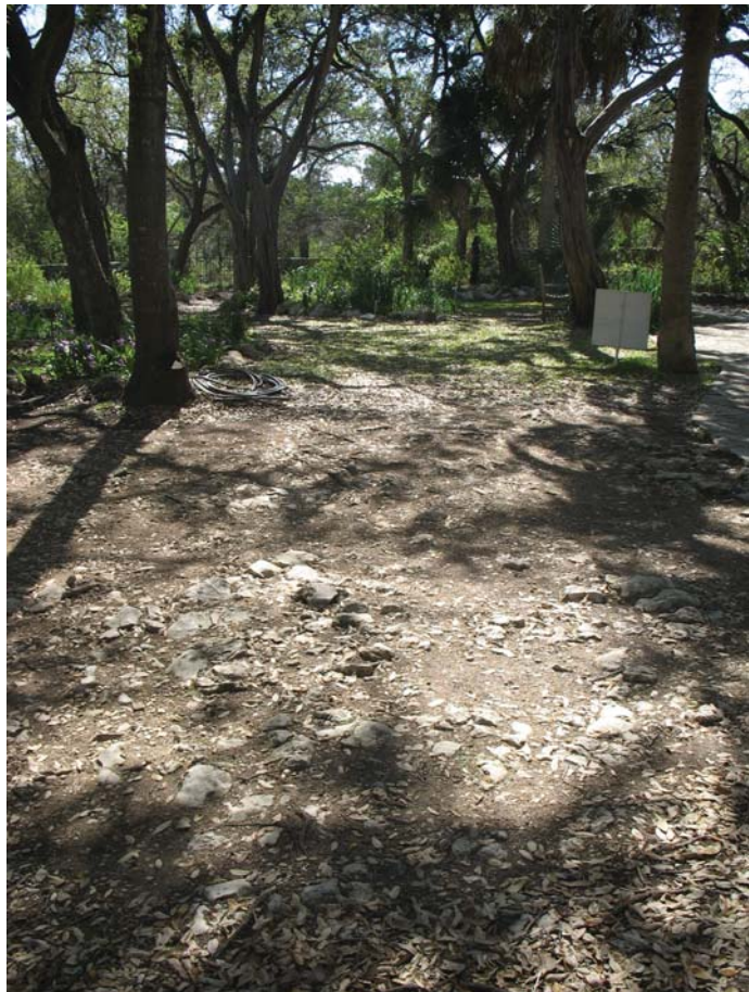
View facing West from Arch: erosion exposing stones and rock subgrade