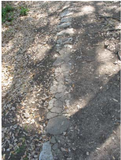
Close-up of wall remnants requiring reconstruction to prevent further site erosion