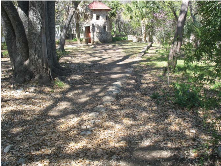
View facing North from Arch of stone wall remnants requiring reconstruction to prevent further site erosion