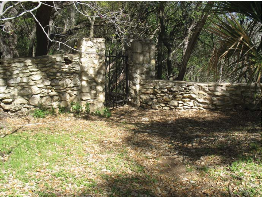
View facing East toward NE Gate -- erosion exposing irrigation pipes, roots, and depositing soil beyond gate