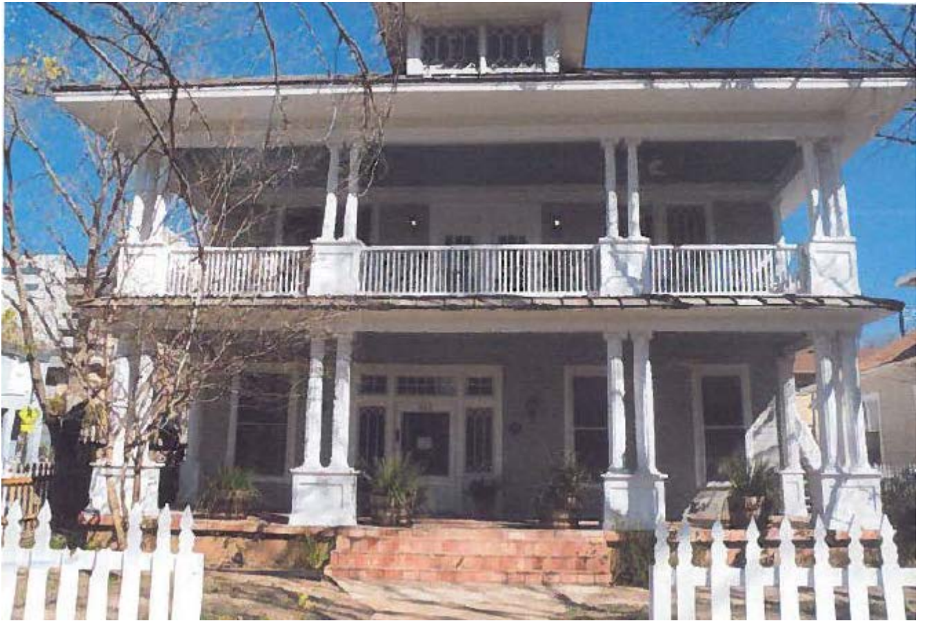
View of the house with the existing wood picket fence (approved for removal by the Commission on April 22, 2013).