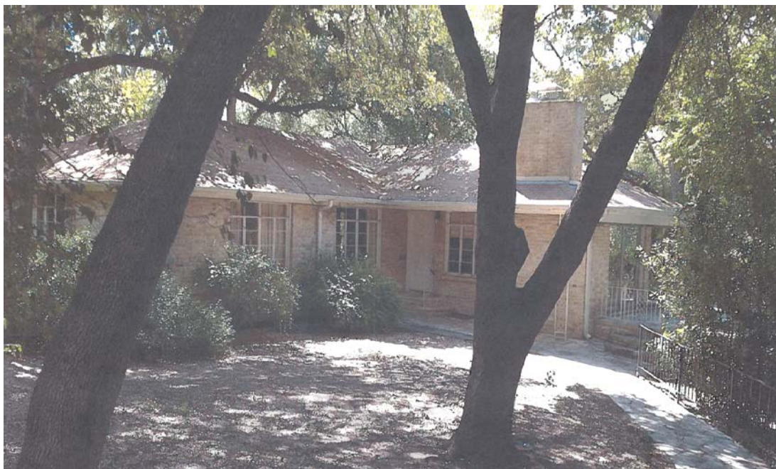
3700 Greenway ca. 1951