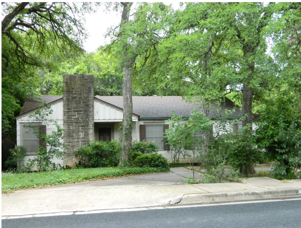
3407 Windsor Road ca. 1940