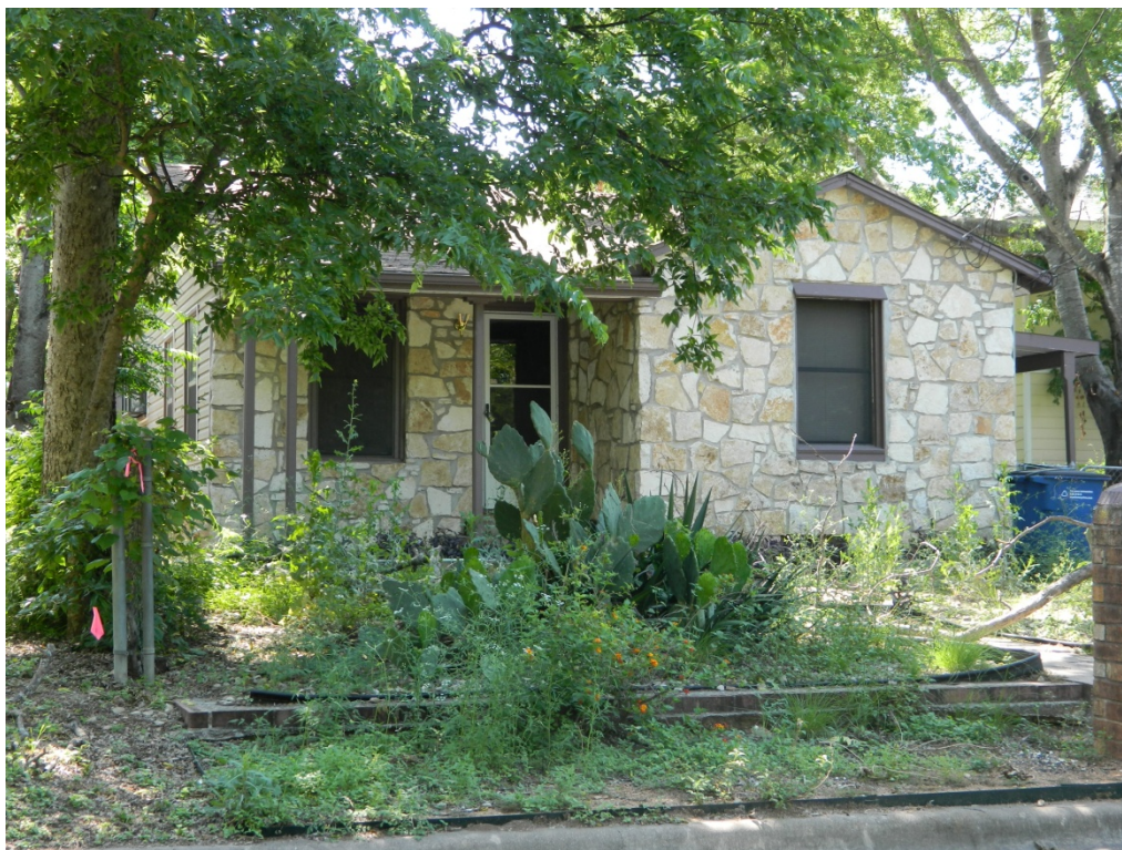
4705 Rowena Avenue ca. 1950