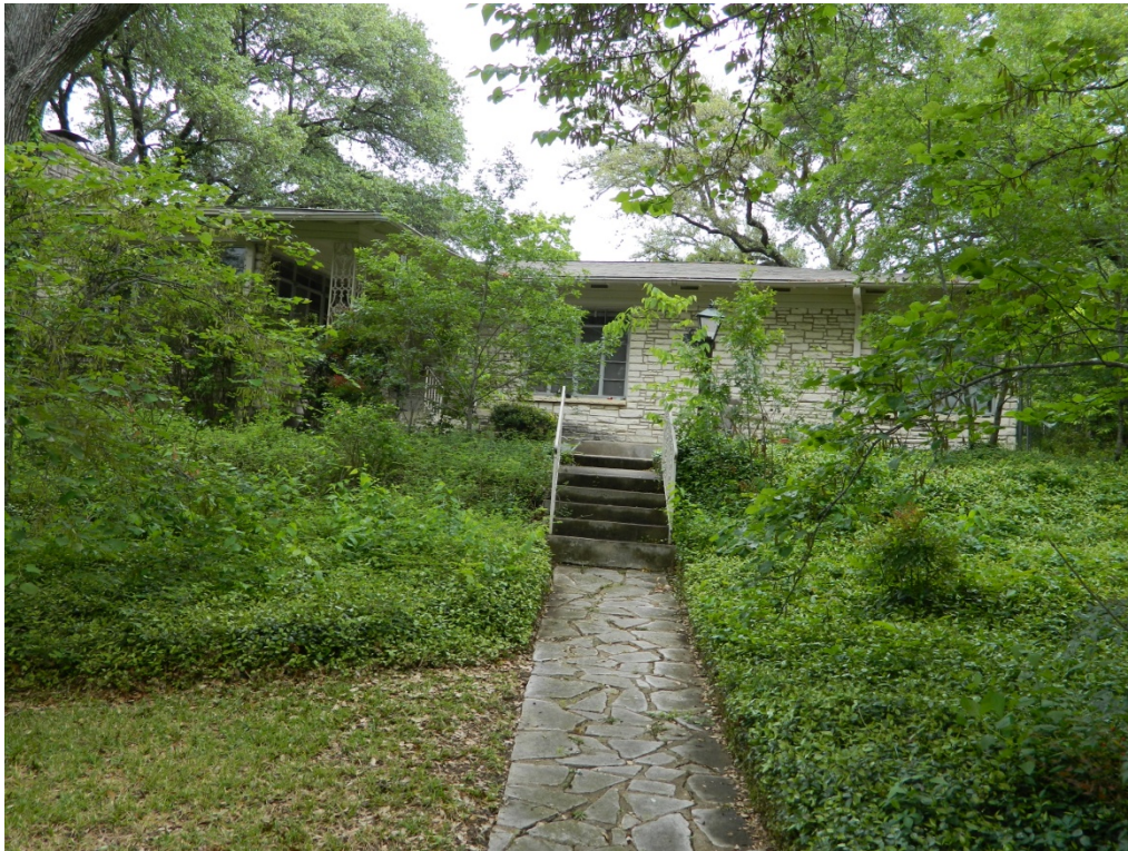
2804 Greenlee Drive ca. 1951