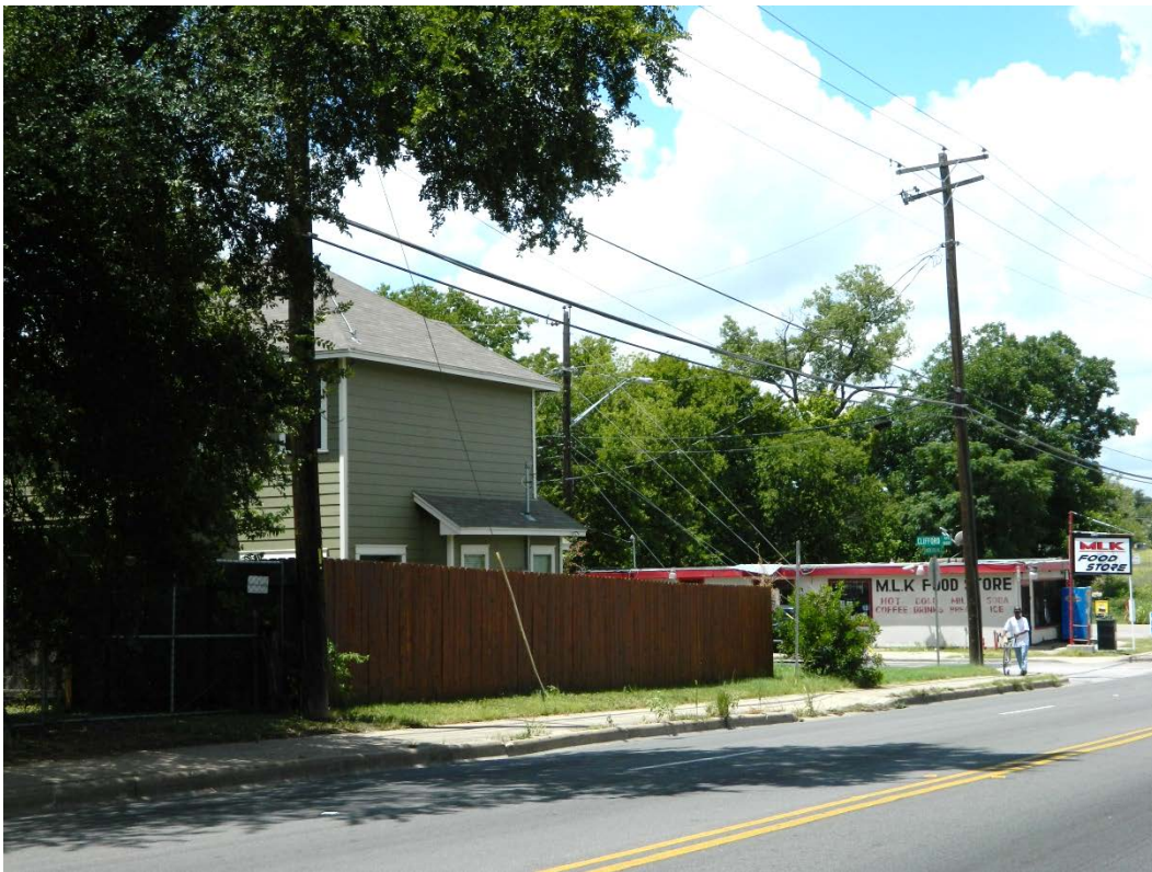
View looking west along the south side of Martin Luther King Boulevard from the proposed site.