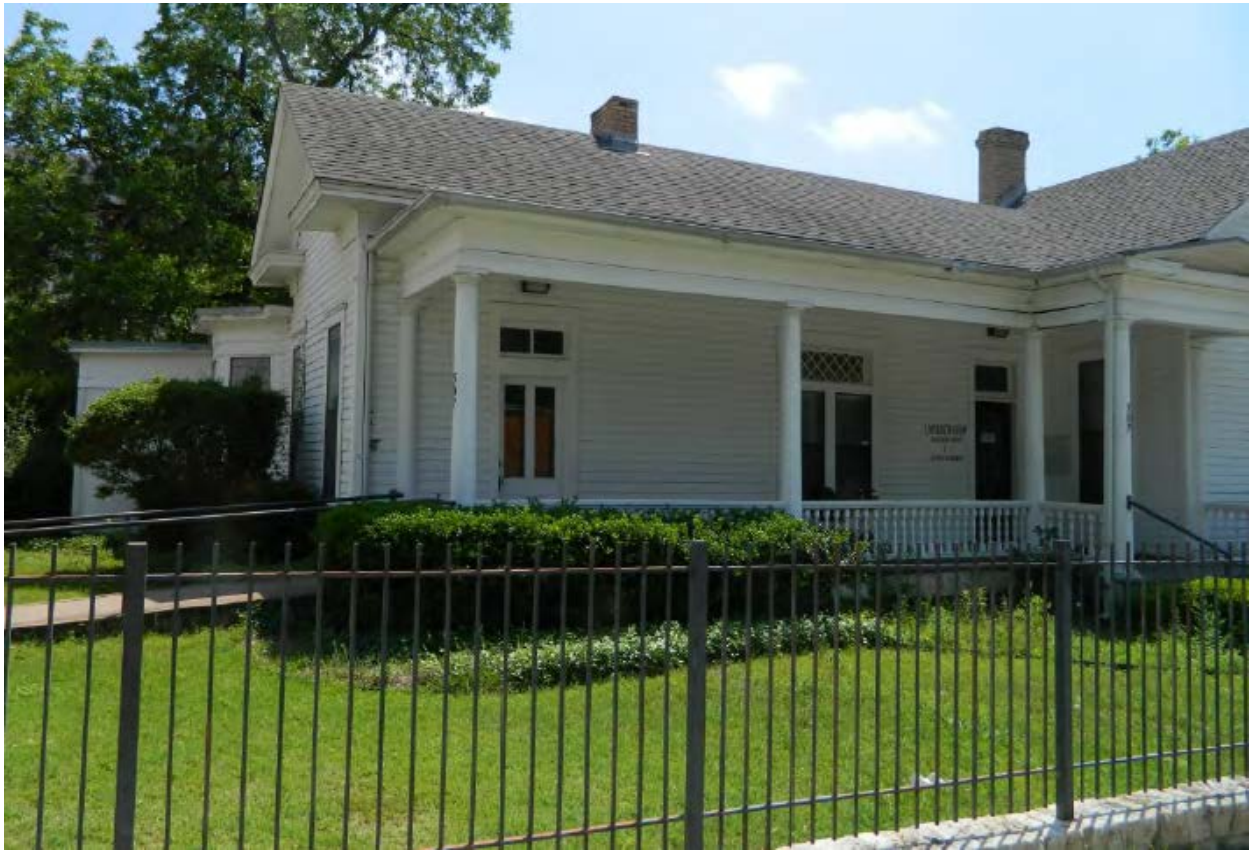
The Dabney-Horne House, 507 W. 23 rd Street in West Campus