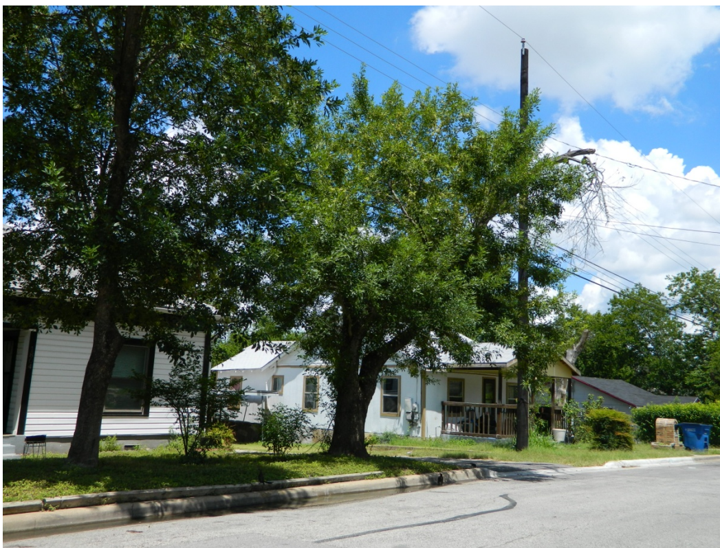
Sanchez Street, just south of the proposed site.