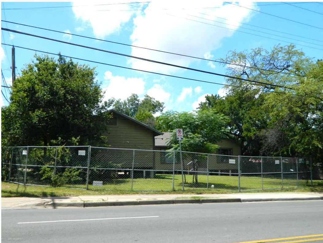
The proposed site at the corner of E. Martin Luther King Boulevard and Sanchez Street.