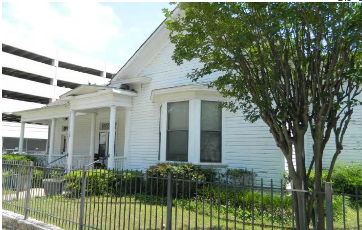
The Dabney-Horne House, 507 W. 23 rd Street in West Campus