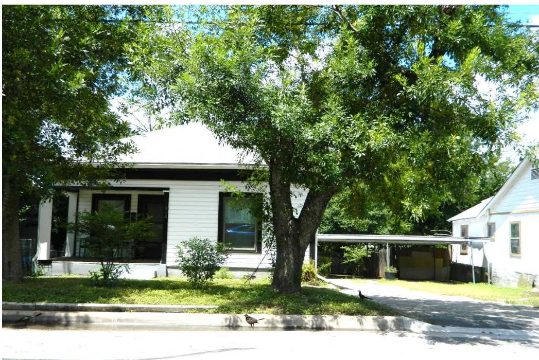
There is one historic-age house on Sanchez Street.