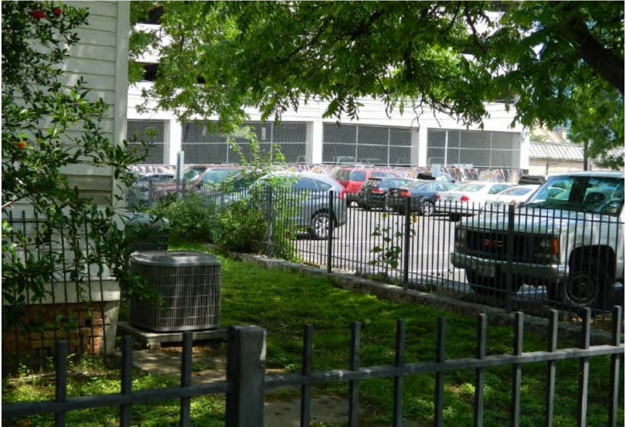
Current context of the Dabney-Horne House – large parking lot to the rear and modern high-rise buildings to the west.