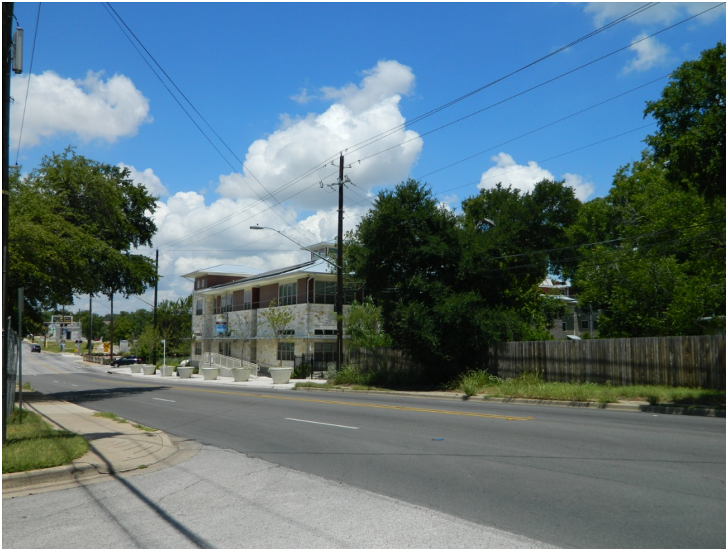
View looking west along Martin Luther King Boulevard from the corner of Sanchez Street.