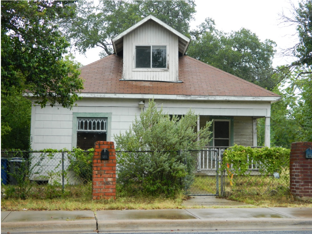
902 West Live Oak Street ca. 1929