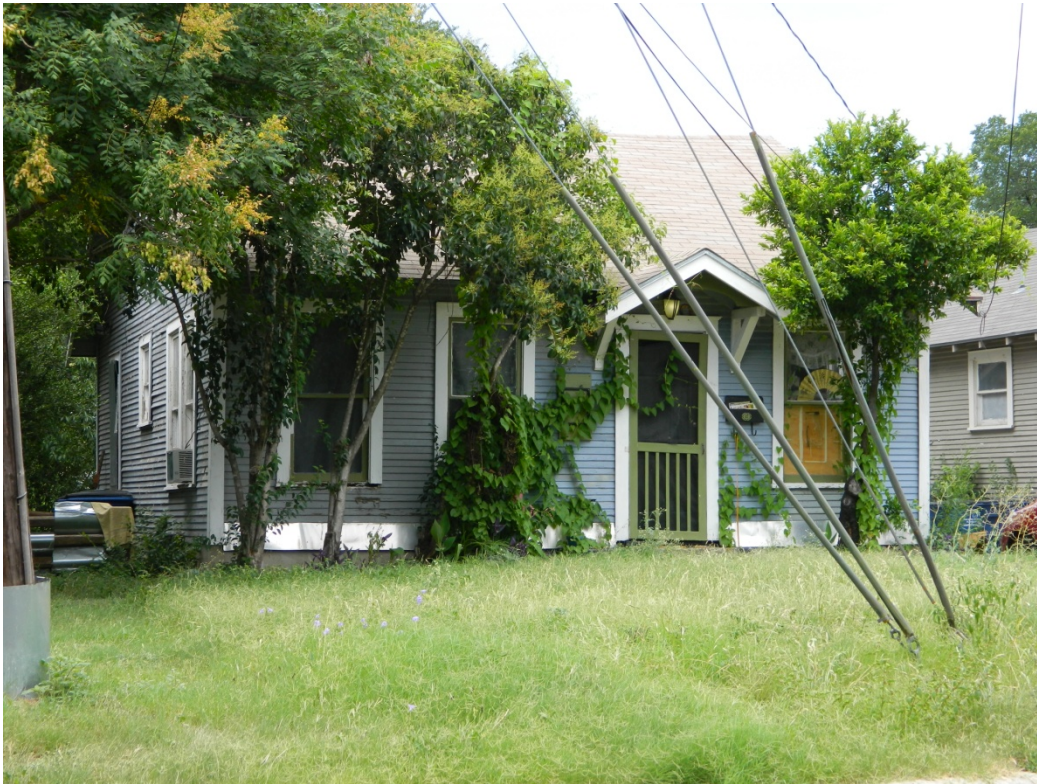
814 San Marcos Street ca. 1935