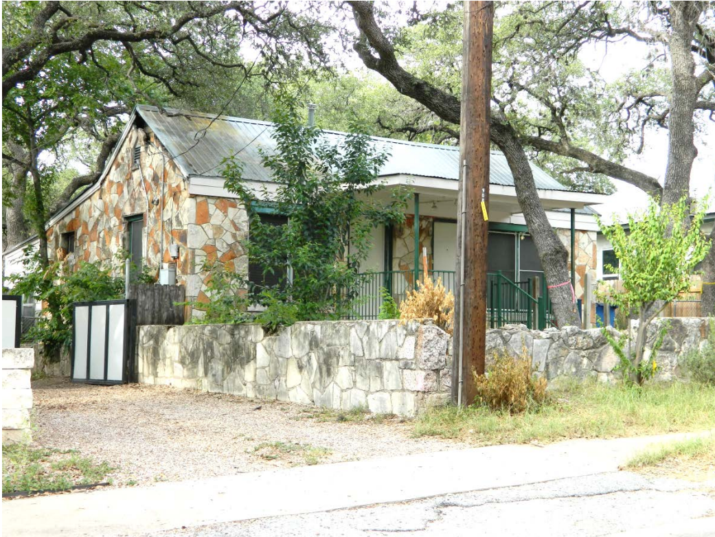
908 West Elizabeth Street ca. 1936