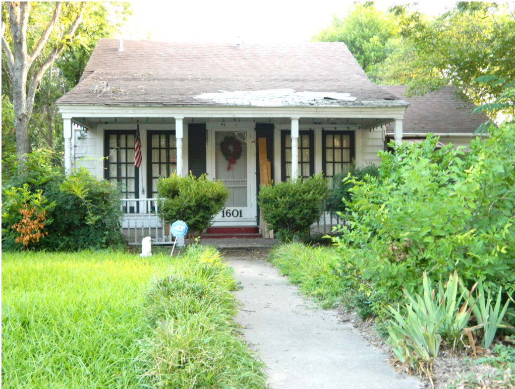
1601 W. 39½ Street ca. 1940