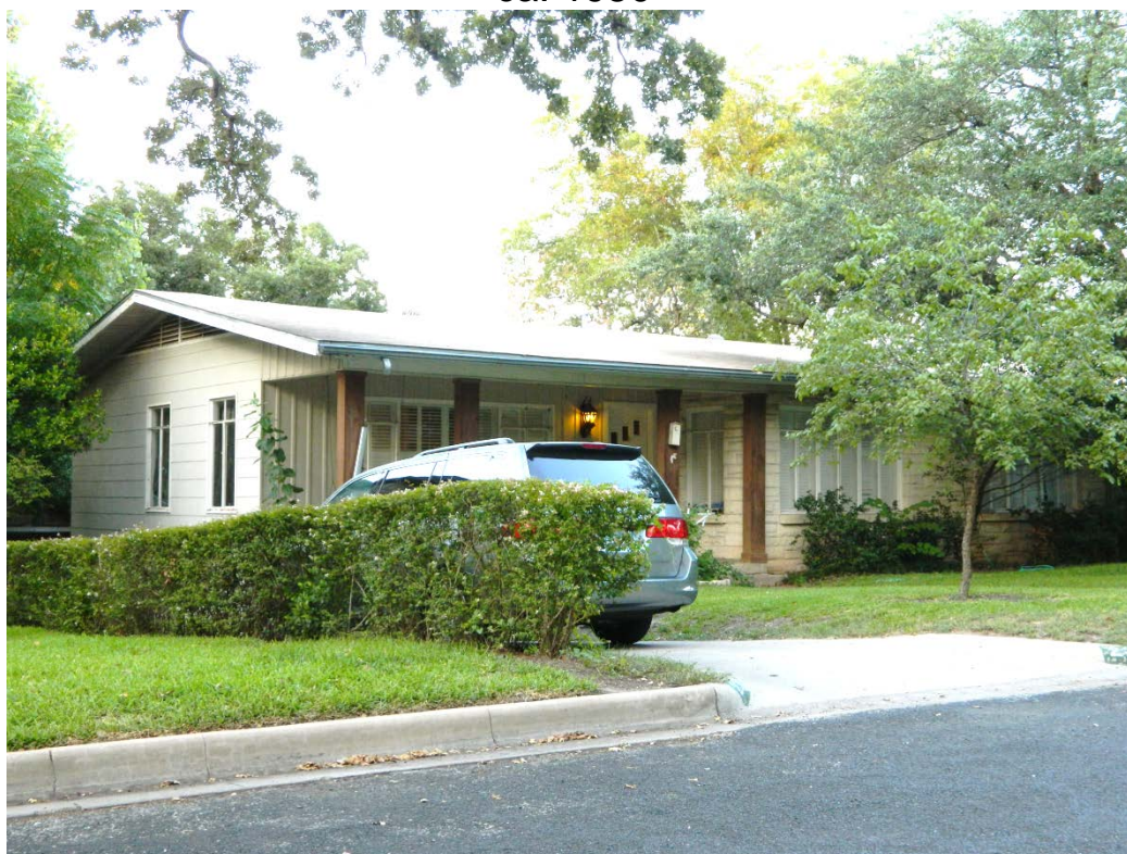
2304 Sunny Slope Drive ca. 1950