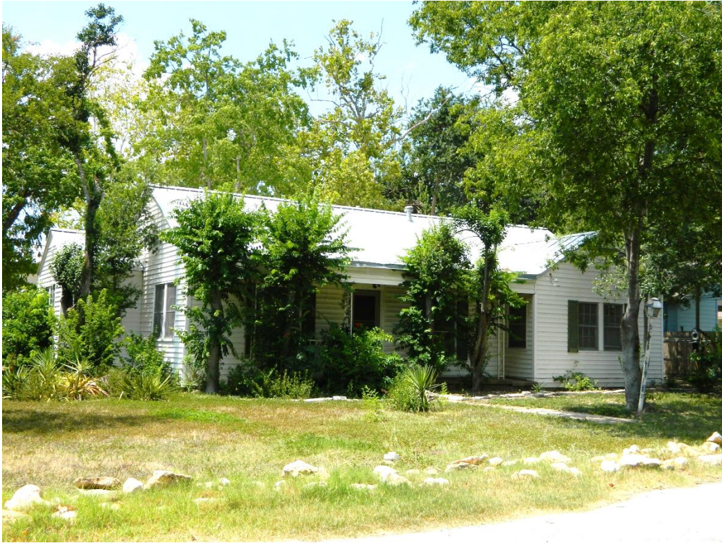
5500 Montview Street ca. 1941