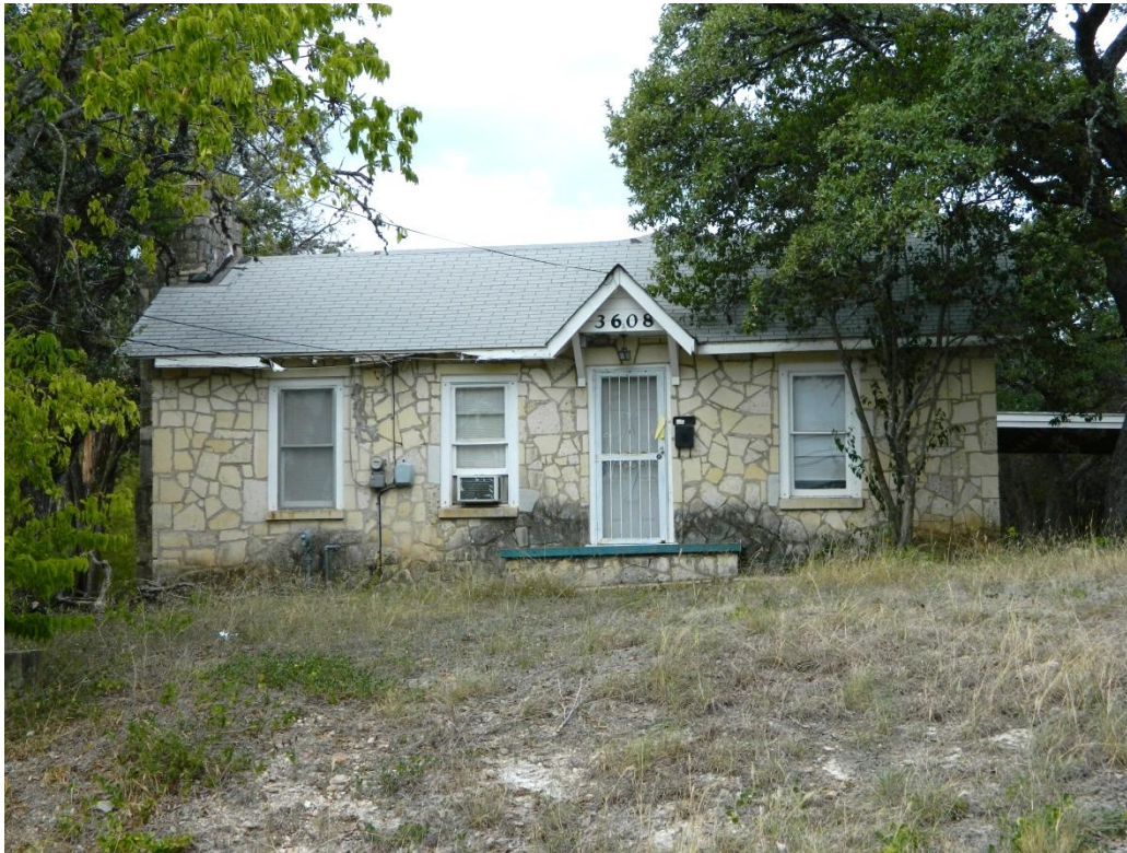
3608 Clawson Road ca. 1938