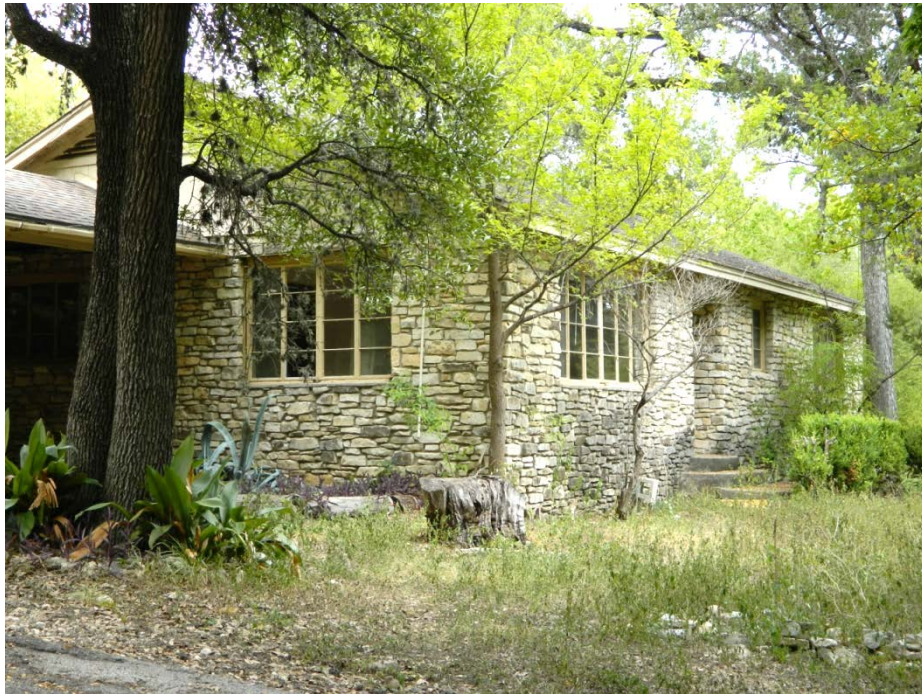
3706 Clawson Road ca. 1966