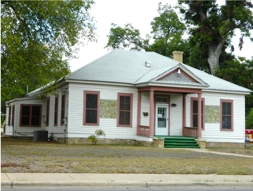
1110 Tillery Street ca. 1900