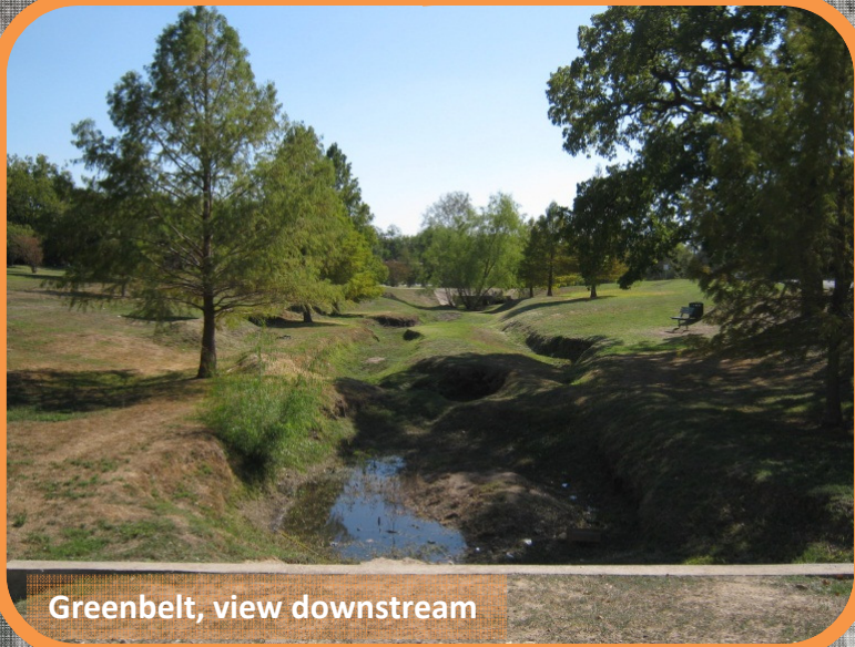
Greenbelt, view downstream