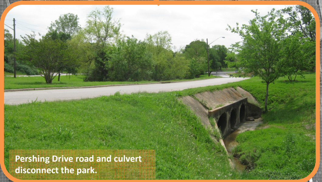
Pershing Drive road and culvert disconnect the park.