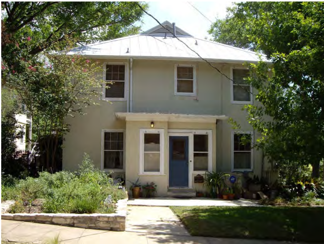
1711 San Gabriel View of entry on north façade

PERSON MAKING EVALUATION OF CONTRIBUTING/NON-CONTRIBUTING STATUS: City of Austin Historic Preservation Office