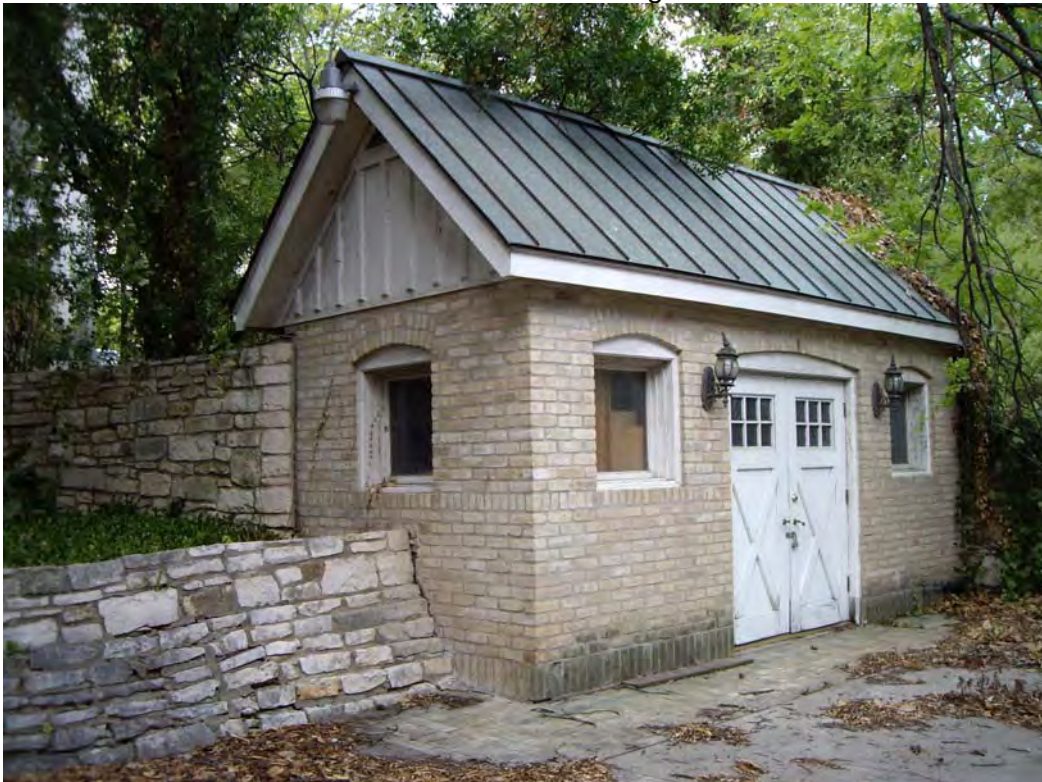
1703 West Avenue Carriage House

PERSON MAKING EVALUATION OF CONTRIBUTING STATUS: City of Austin Historic Preservation Office