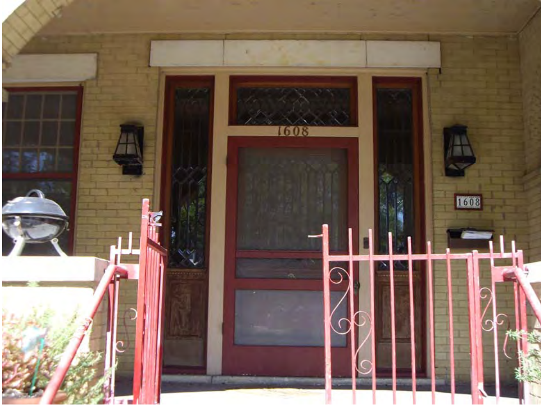
1608 West Avenue Front door detail above. Garage below.