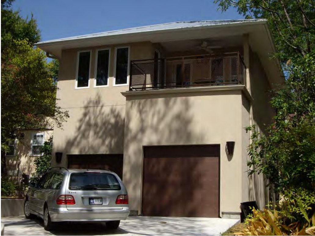
1711 San Gabriel Garage Apartment, modern