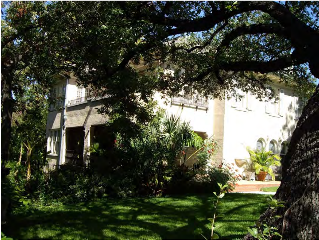
1510 West Avenue South and East facades, above. Garage below.