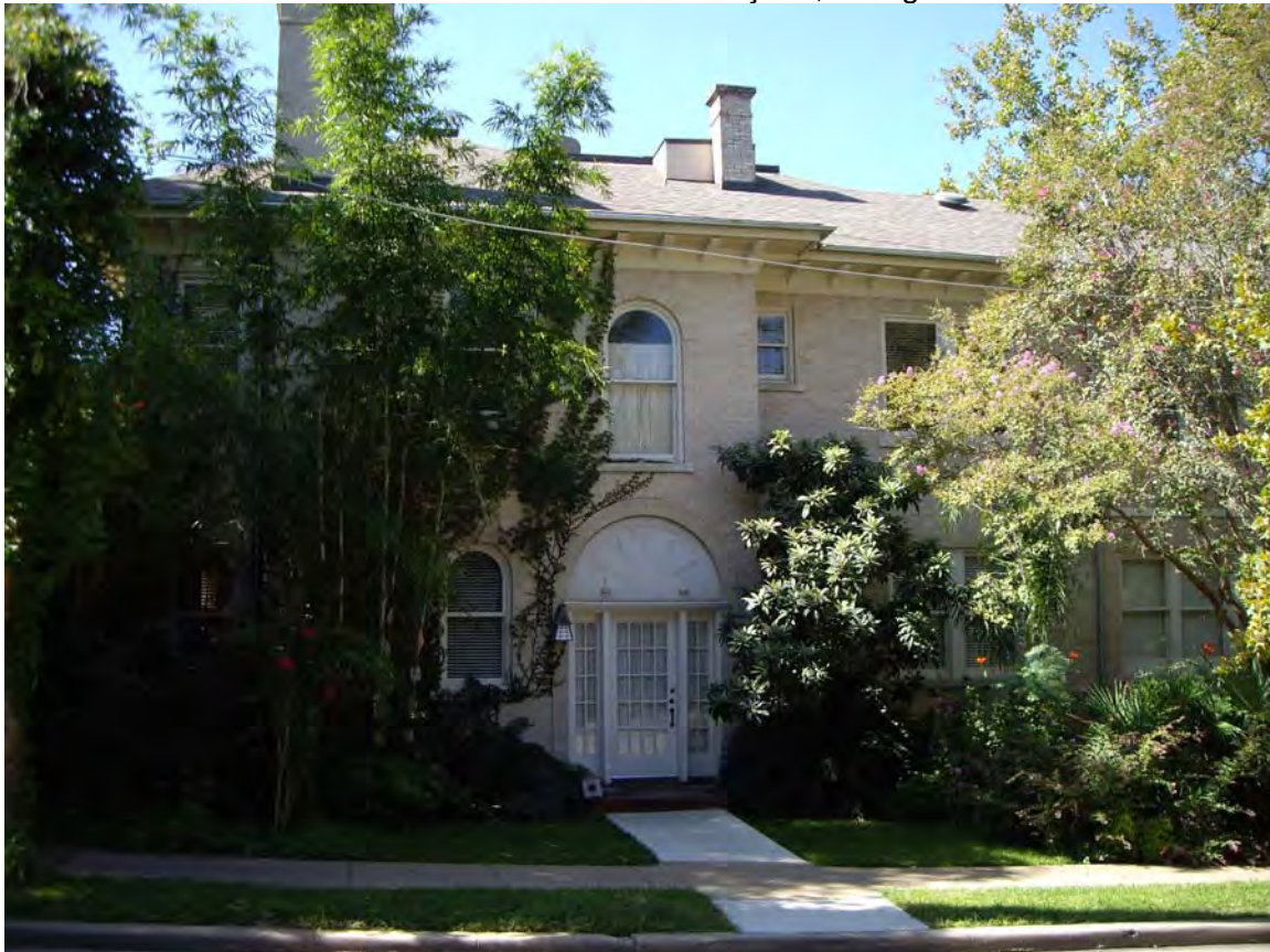
1510 West Avenue View of north façade, facing 16 th Street

PERSON MAKING EVALUATION OF CONTRIBUTING/NON-CONTRIBUTING STATUS: City of Austin Historic Preservation Office