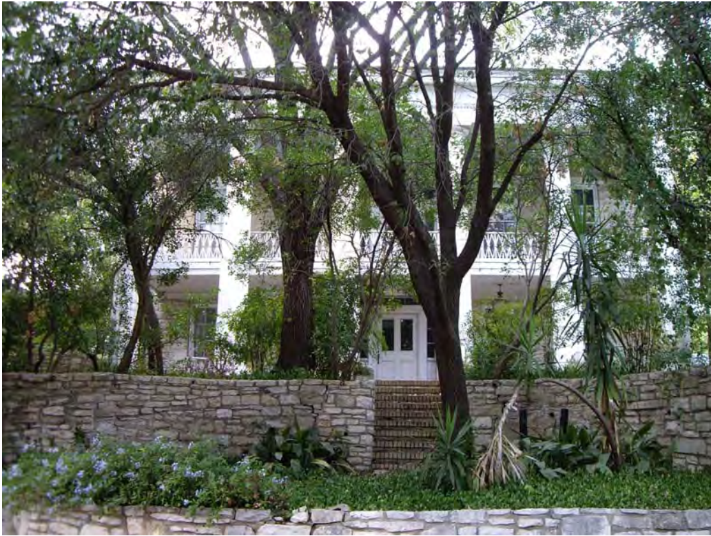
1703 West Avenue Original front façade, now rear, above. Historic drawing below.