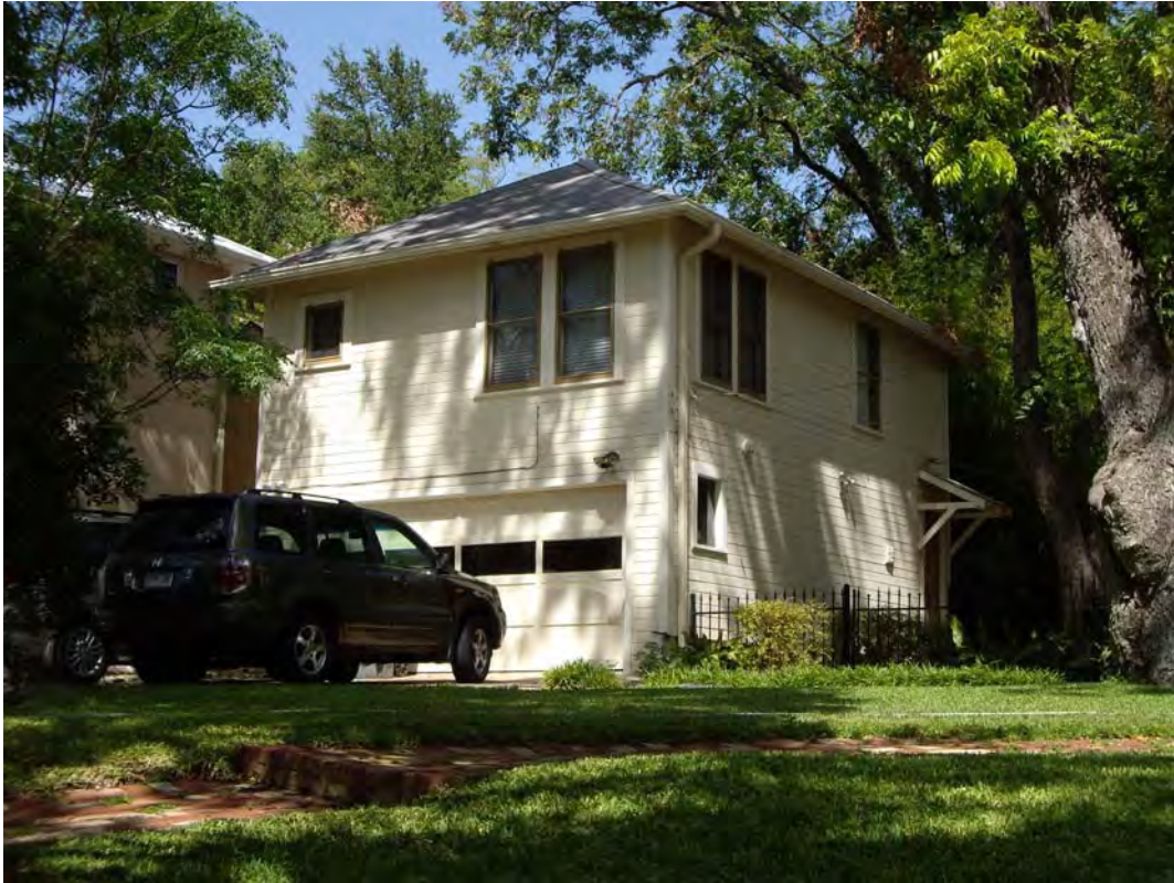
1701 San Gabriel