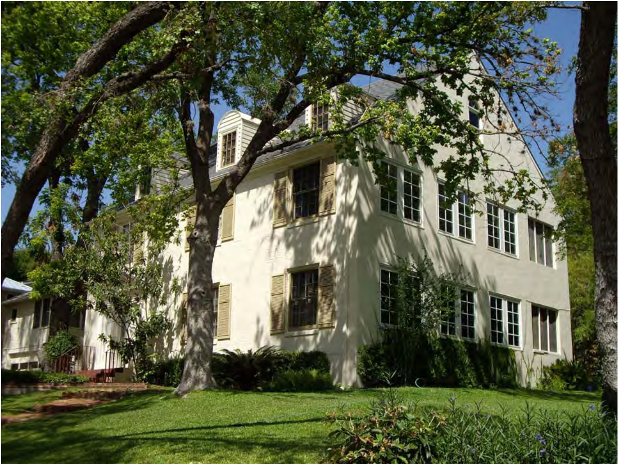
1701 San Gabriel View of south and west facades.

PERSON MAKING EVALUATION OF CONTRIBUTING STATUS: City of Austin Historic Preservation Office