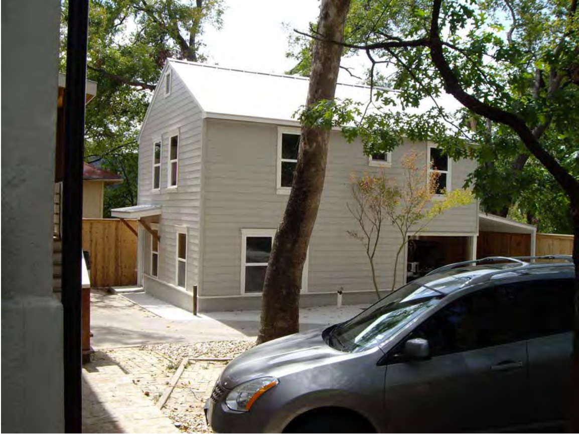
1601 West Avenue Rear Garage Apartment