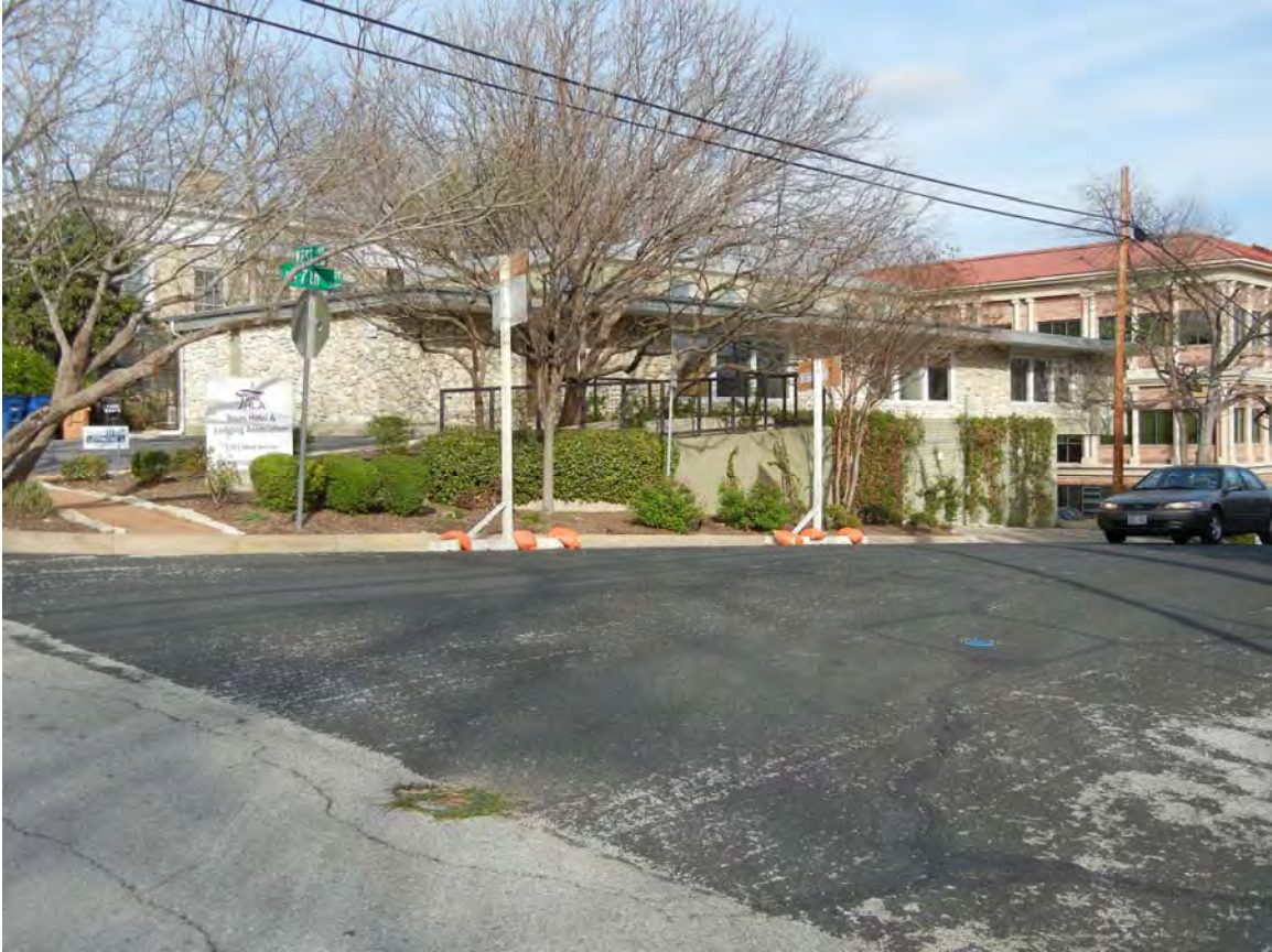
View of south façade of 1701 West Avenue from 17 th Street at West Avenue.