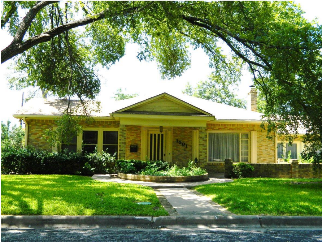
1501 Richcreek Road ca. 1951