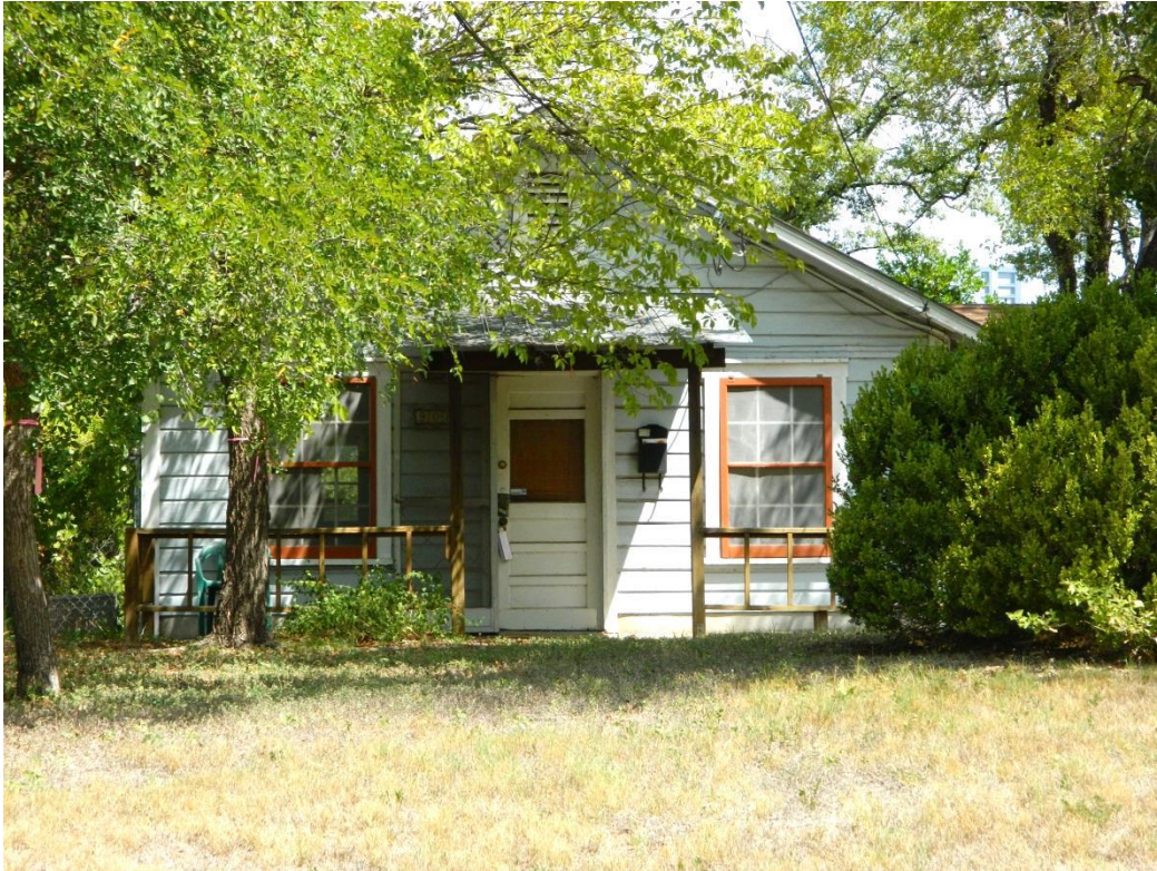
908 Retama Street ca. 1946 – ca. 1948