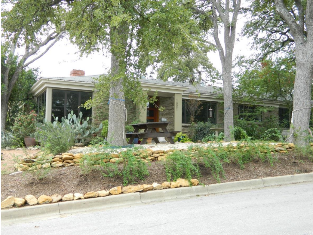
1501 Hillmont Street ca. 1948