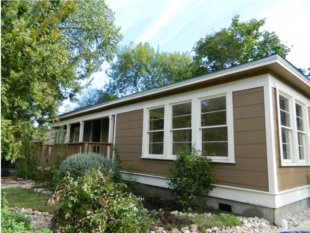
27 Margranita Crescent ca. 1946