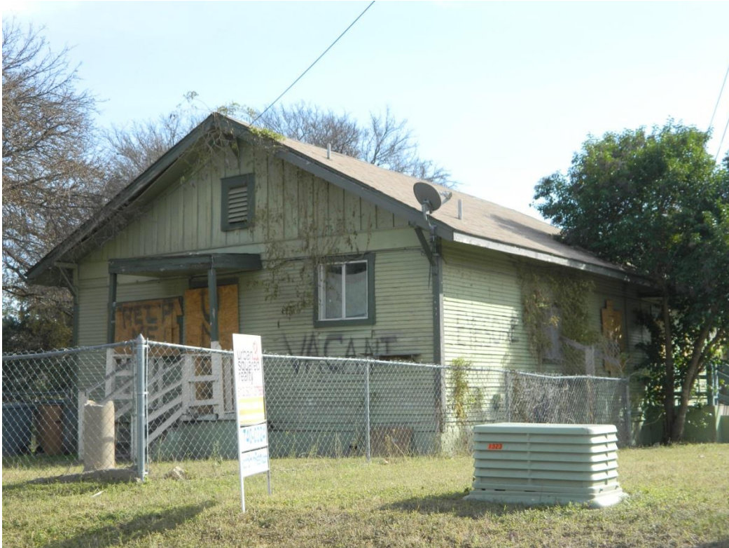
2601 Sol Wilson Avenue Moved to this site in 1957