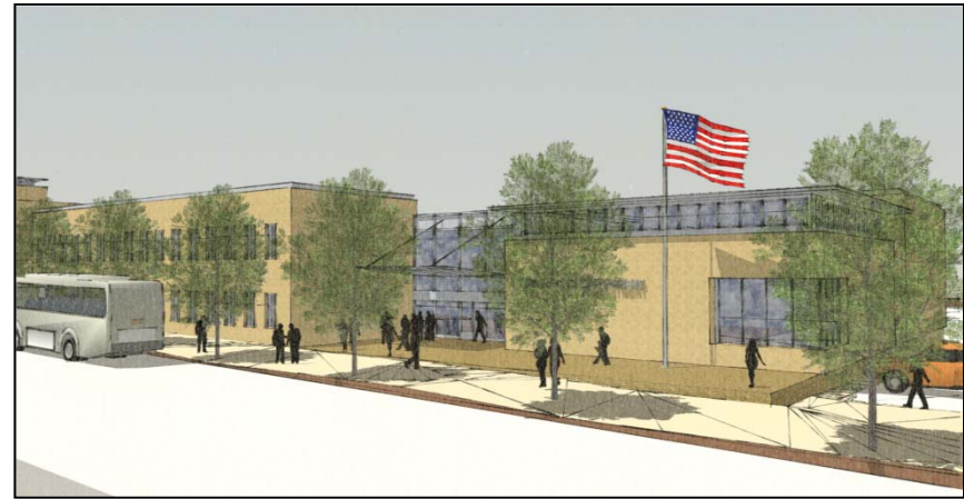
N/E Substation Artistic Rendering