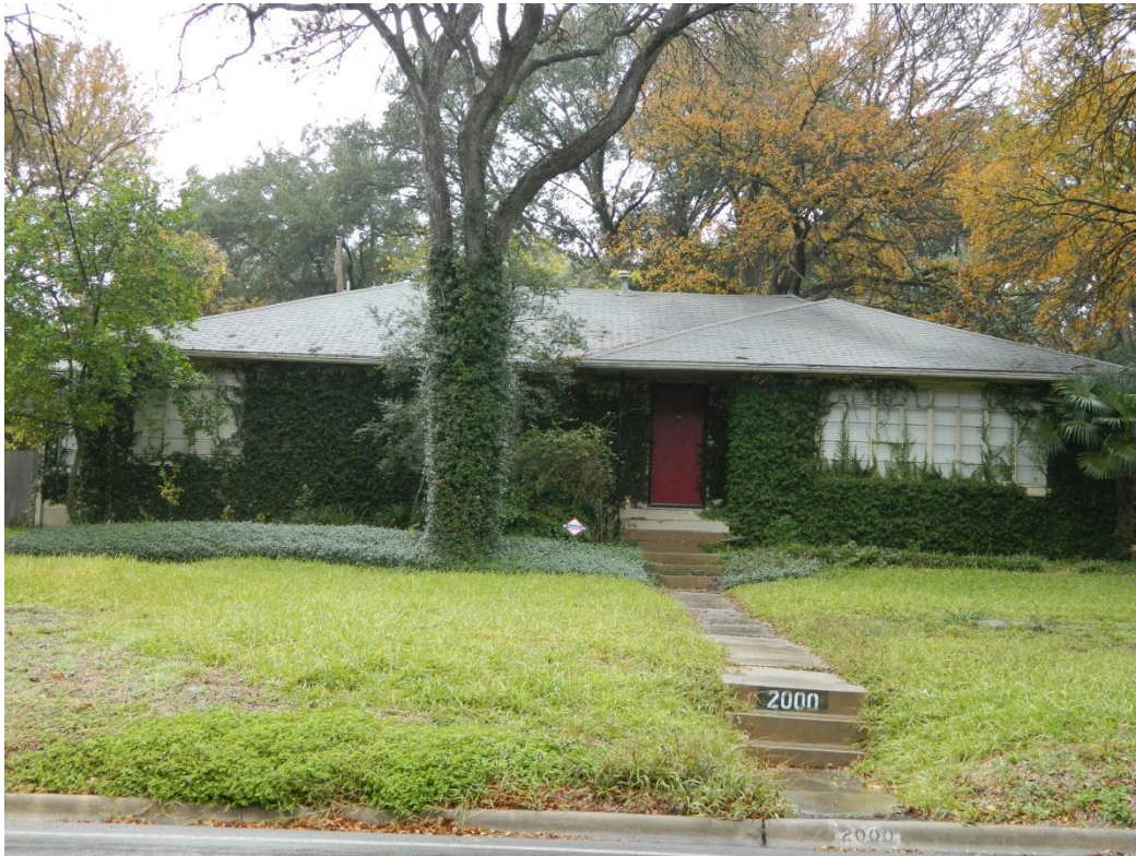
2000 Exposition Boulevard ca. 1950