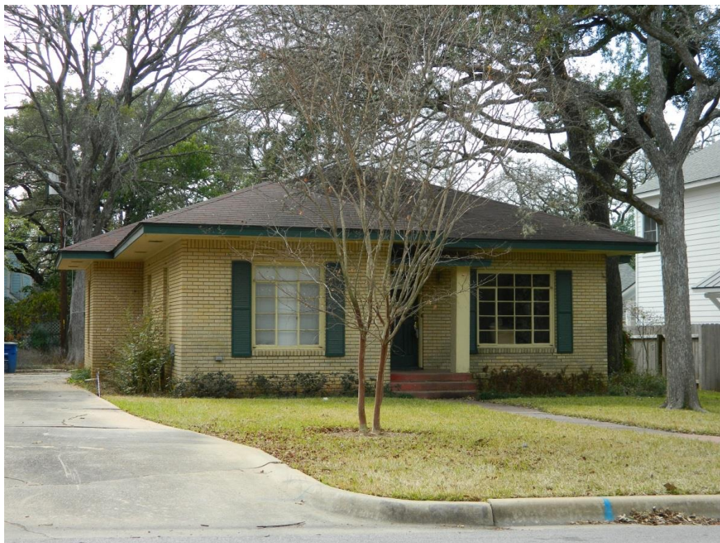
3215 Bridle Path ca. 1949