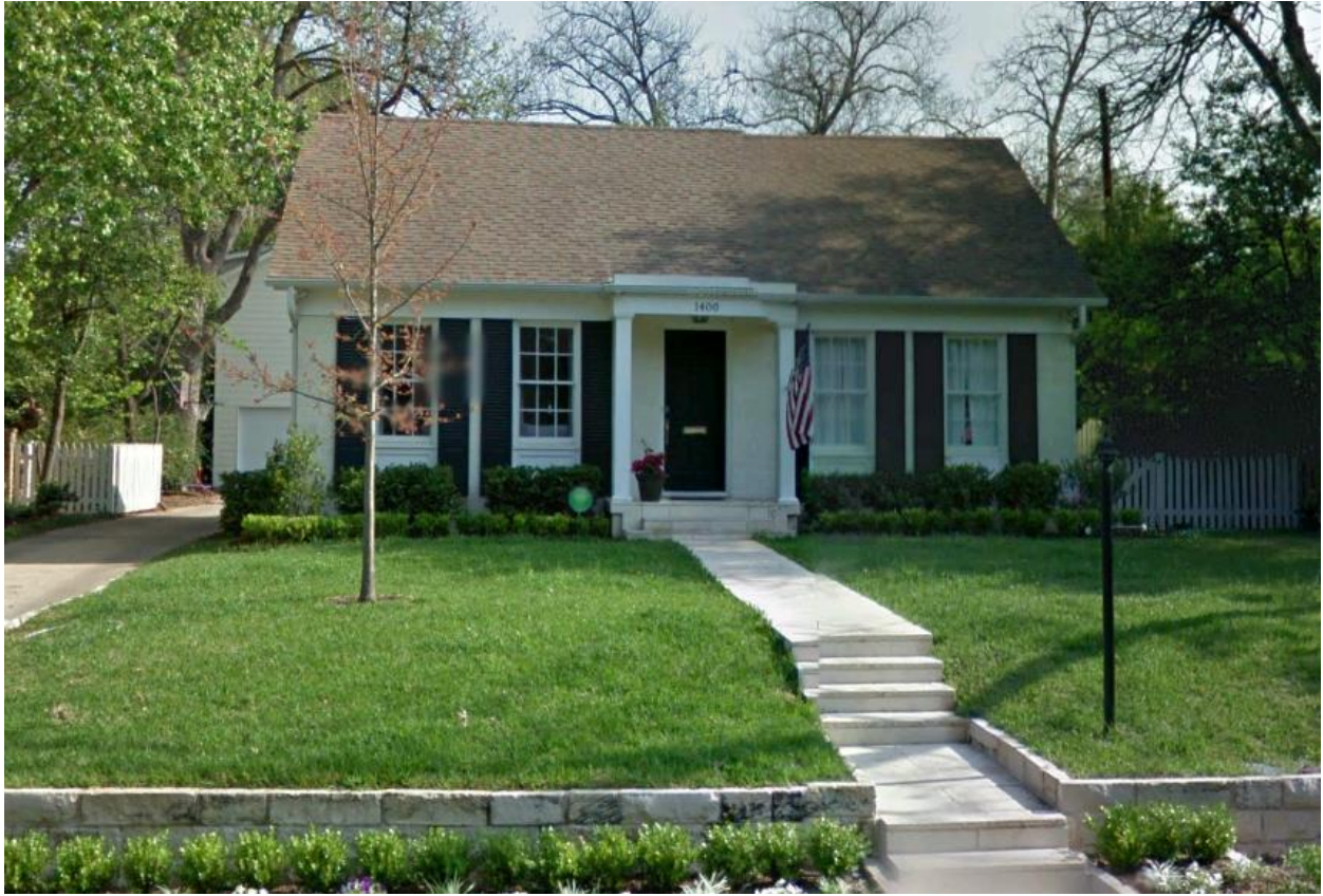
1400 Preston Avenue