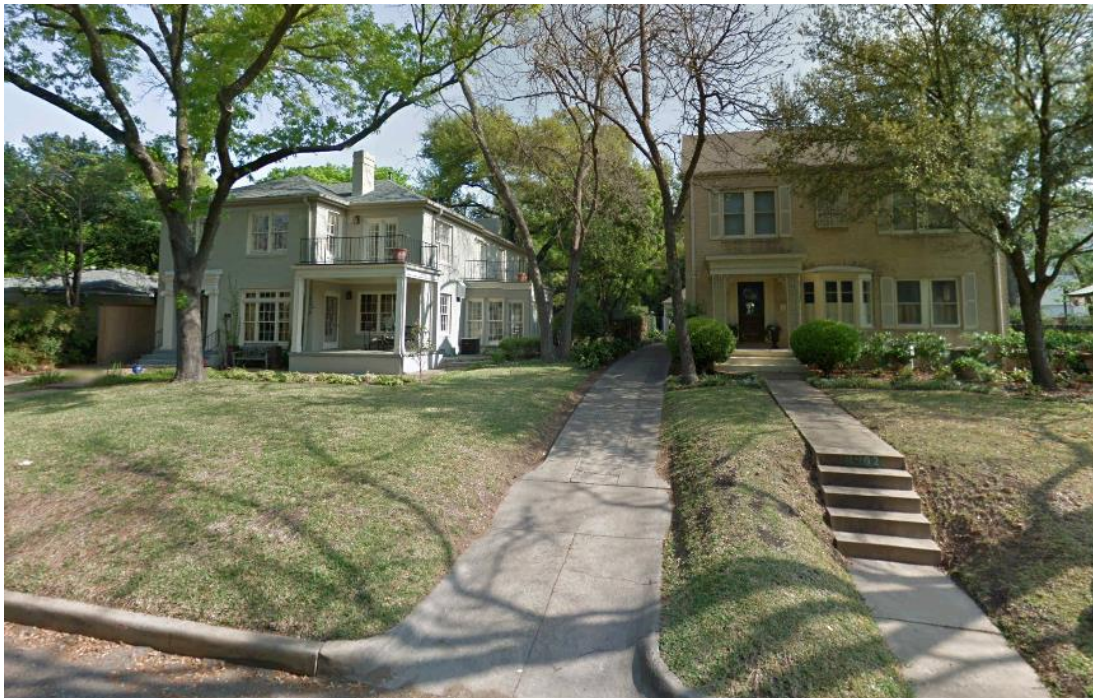
Contributing properties on same block as 1400 Preston Avenue