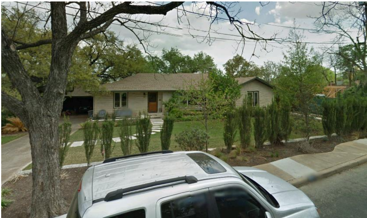
Other houses on Churchill Drive