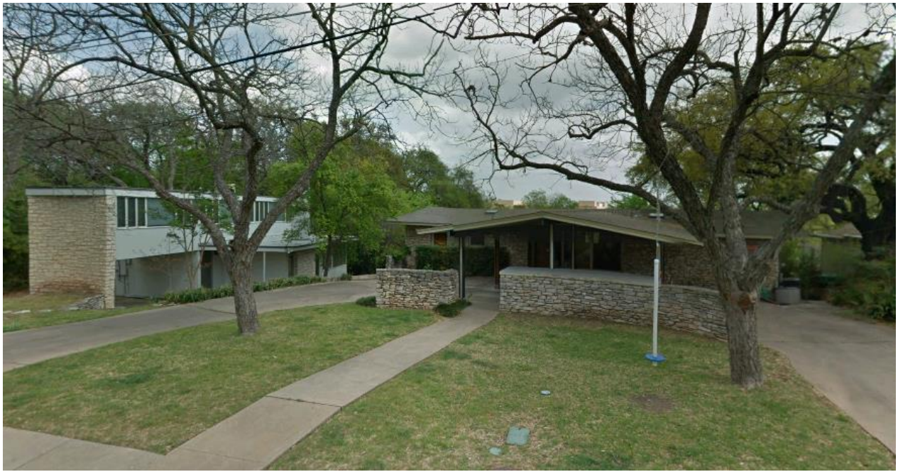
Other houses on Churchill Drive