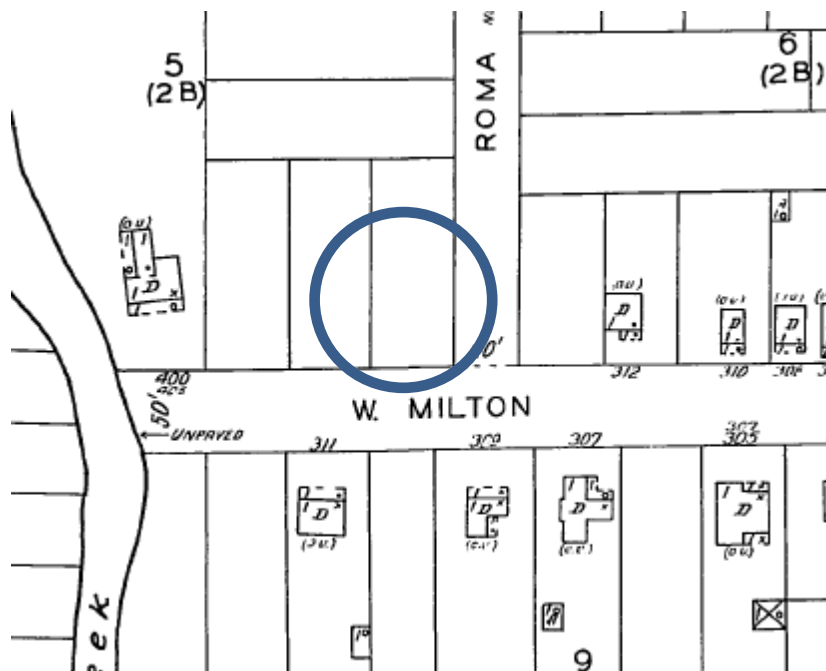
The 1935 Sanborn map shows the site of the current house as vacant.

Leonora Casarez is believed to have died in Houston in 2002.