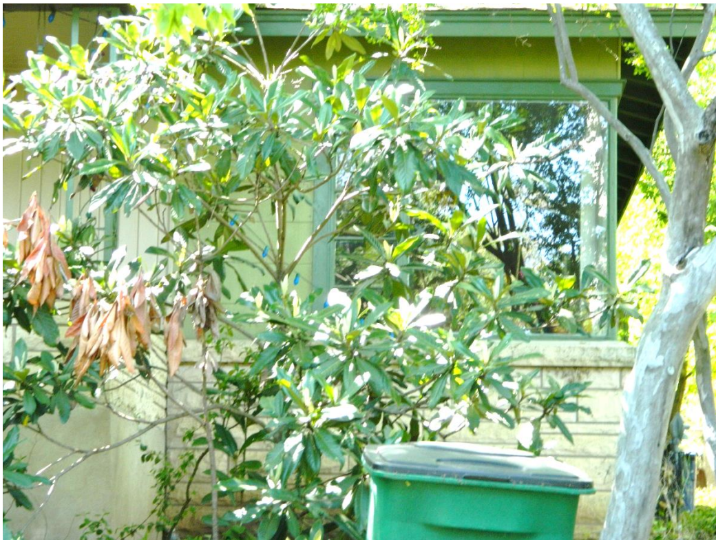
Detail showing stone wainscoting and corner wraparound window