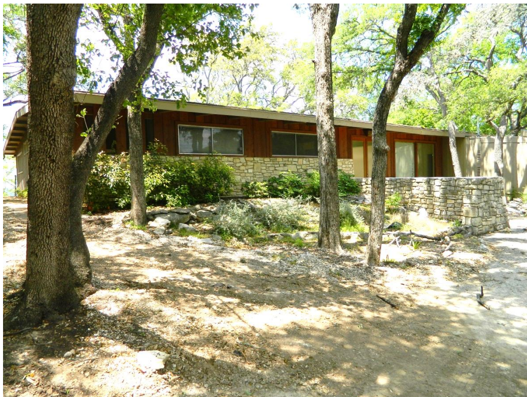
3505 Mount Barker Drive ca. 1957