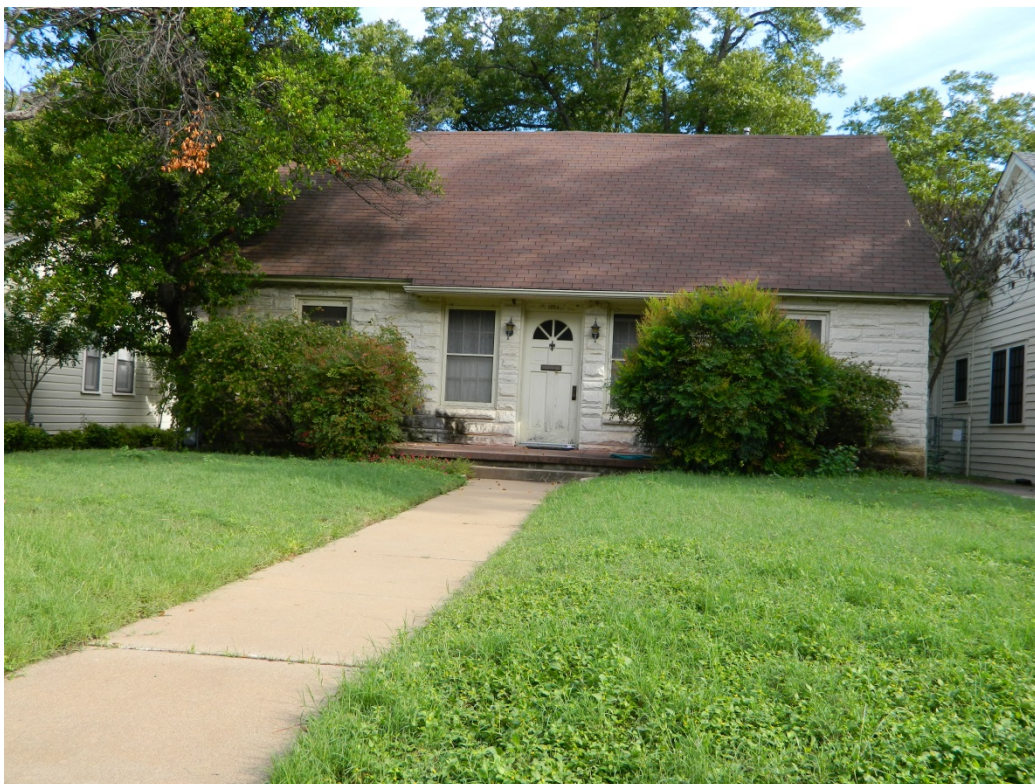
1504 Northwood Road ca. 1937